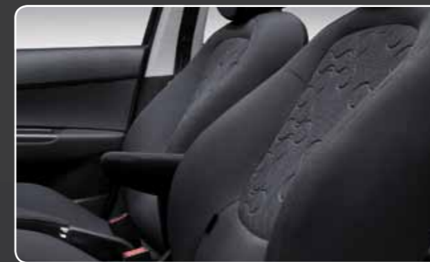
Black Cloth (Active/Elite)