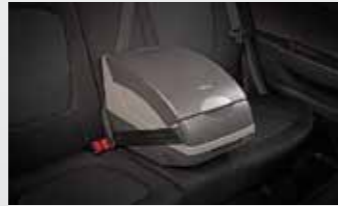
Portable cooler 3 • Ergonomically Designed • Thermoelectric Functionality