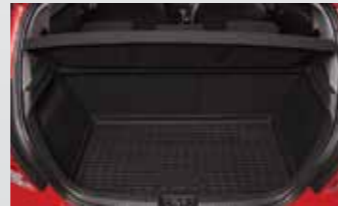
Cargo Liner • Contoured to fit your boot • High Quality Material