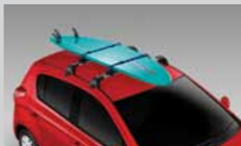
Surfboard Carrier • Soft cradle protects the surfboard • Easy to install