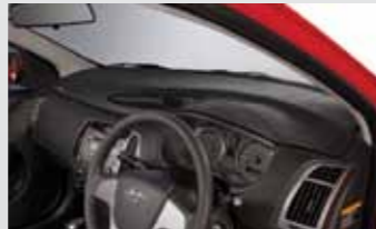
Dash Mat • UV Stabilised • Complementary Colour