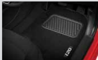
Tailored Carpet Floor Mat (set of 4) • Contoured • High Grade