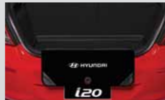
Fabric Bumper Protector • Protective • Non-Slip Backing