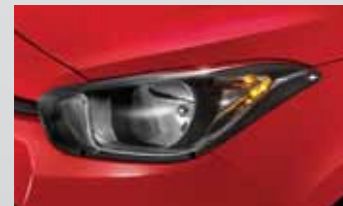
Headlight Protectors (set of 2) • UV Resistant • Shock Resistant