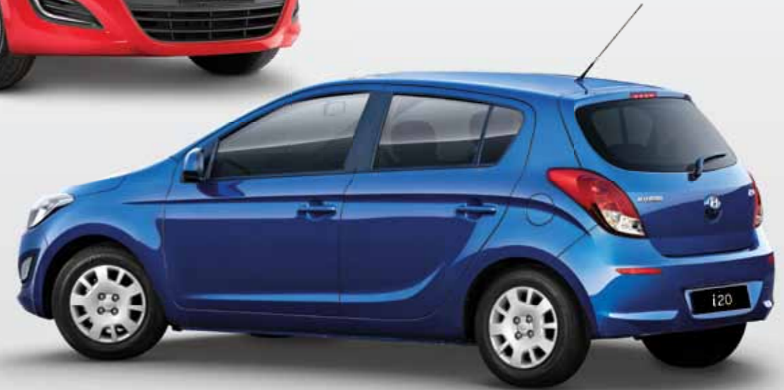
i20 Active in Pristine Blue