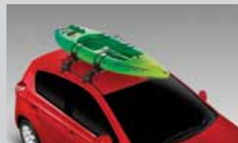
Kayak Holder • Easy to use • Securely Fastened