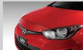
Bonnet Protector • Protective • Tough and Durable