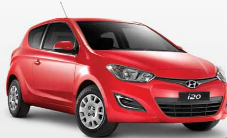
i20 Active in Electric Red