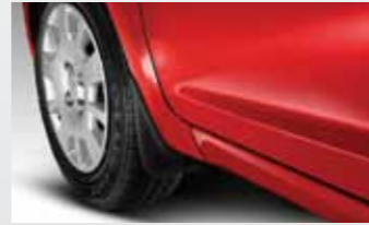
Front Mudflaps (set of 2) 4 • Tough Wearing • Protective