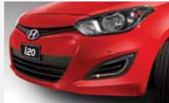
Front Park Assist 6 • Makes it easier and safer to park