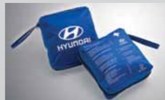
Universal First Aid Kit • Convenient • Comprehensive