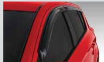
Tinted Stylevisors • Slimline • UV Resistant