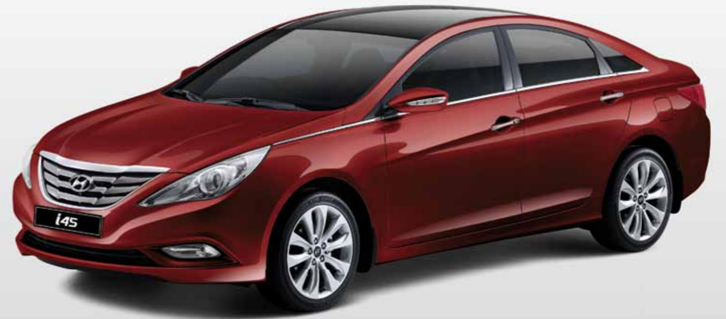
i45 Premium in Remington Red.