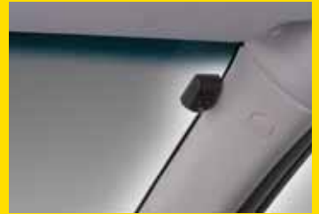
Bluetooth® Phone Kit 1