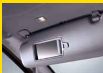
Illuminated vanity mirrors with covers