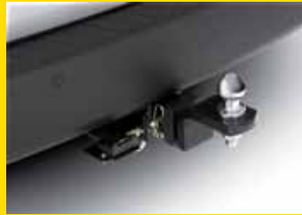
Towbar, Towball & Trailer Wiring Harness 2