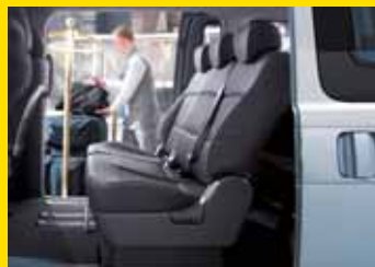
2 sliding doors for easy access