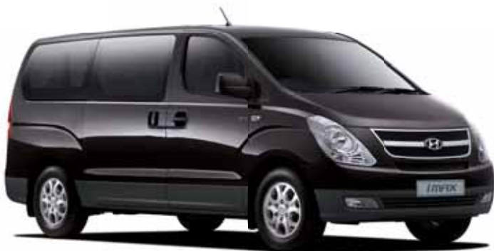
Hyundai iMax shuttle shown in Space Black

It's your turn behind the wheel. Live your life and shape your own future. Our promise is to deliver first-class value through innovative technology, advanced safety features and a determination to build the highest quality vehicles possible. Our guarantee to you is your satisfaction with vehicles that perfectly fit your needs and lifestyle. An extensive dealer network and full warranty support means your confidence in your Hyundai need never be compromised.