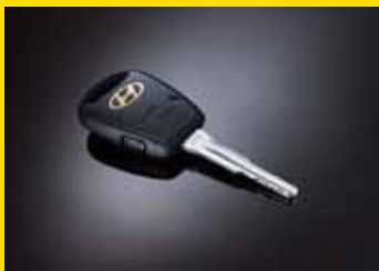
Keyless entry (2 remote keys) with burglar alarm