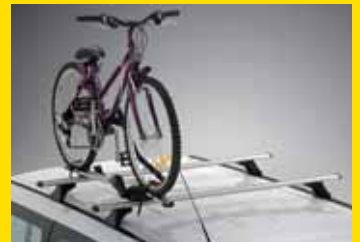
Roof Mounted Bike Carrier