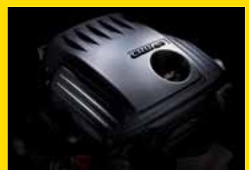
2.5L CRDi high output turbo Diesel