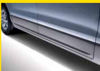
Two tone interior and exterior