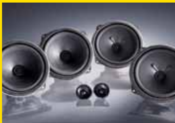
6 Speaker MP3 audio system