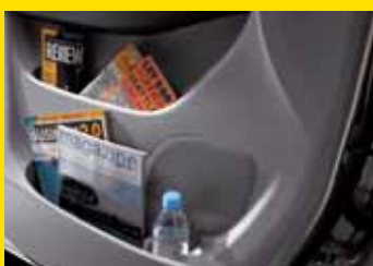
Twin front door pockets