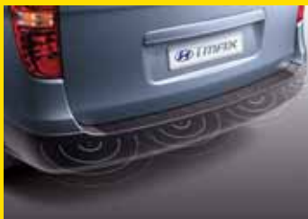
Reverse Park Assist