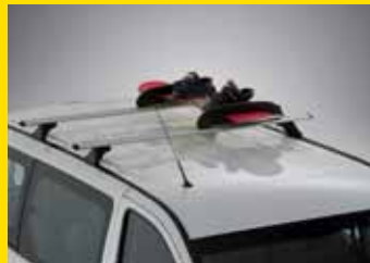
Ski & Snowboard Carrier