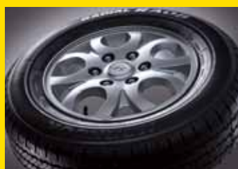
16" alloy wheels