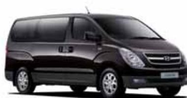
Hyundai iMax shuttle shown in Space Black