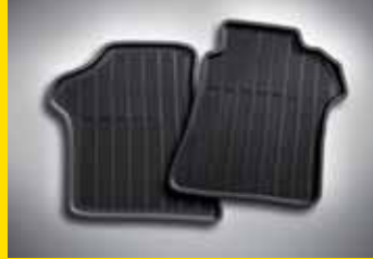
Tailored Rubber Floor Mats