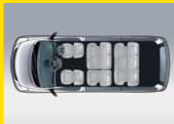
8 seats plus 851L luggage capacity