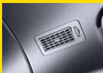
Air conditioning – dual zone system with roof mounted side vents for centre & rear