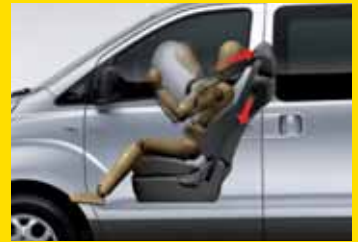
Seatbelt pretensioners and height adjustable seatbelts