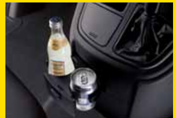
Cup and bottle holders