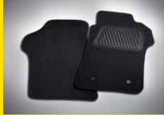
Tailored Carpet Floor Mats