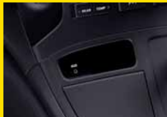
Audio auxiliary input jack for iPod® and MP3 player connectivity