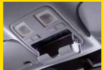
Retractable sunglasses compartment