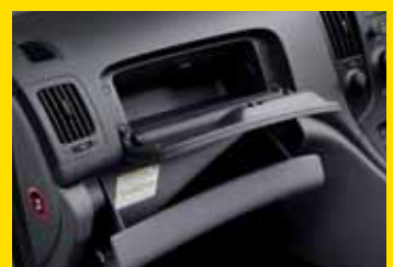
Dual glovebox compartments