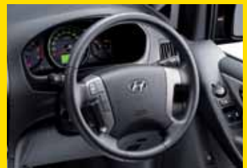
Tilt steering column Steering wheel audio controls