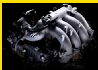
2.4L CVT petrol (auto)