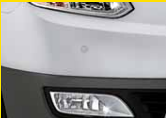
Front Park Assist (4 head) 4