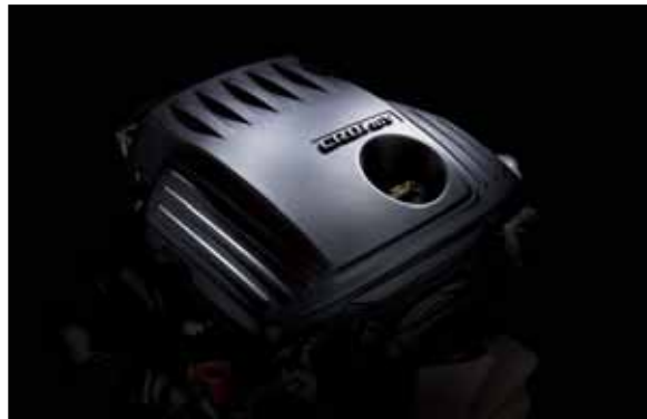
2.4 CVVT petrol