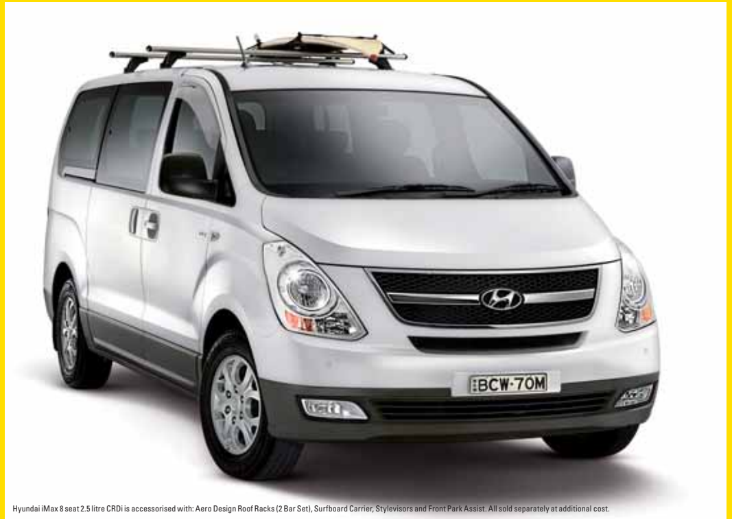
Hyundai iMax 8 seat 2.5litre CRDi is accessorised with: Aero Design Roof Racks (2 Bar Set), Surfboard Carrier, Stylevisors and Front Park Assist. All sold separately at additional cost.

All Accessories are subject to availability and warranty conditions, please refer to our website at www.hyundai.com.au for full warranty terms and conditions.