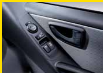
Power windows and mirrors