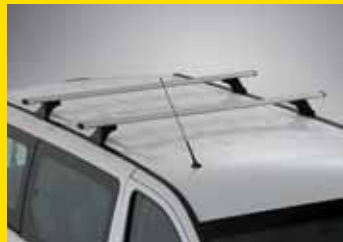
Aero Design Roof Racks (2 bar set) 5