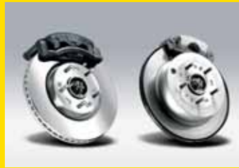
Ventilated disc brakes with ABS and EBD