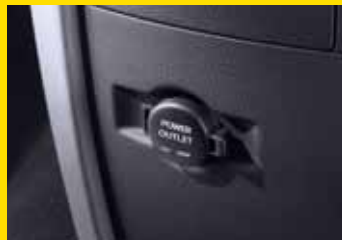
12 volt power outlet