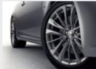
19 X 8.5-INCH ALUMINIUM-ALLOY WHEELS

CONNECTED TO THE ROAD. Style shouldn't end where the car body does. The Q60 Coupé comes with 18-inch, 10-spoke alloy wheels with premium tyres for excellent grip and beautiful performance as standard. Or you may upgrade to 19-inch, 5-triple-spoke alloy wheels.