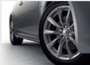
18 X 8.0-INCH ALUMINIUM-ALLOY WHEELS