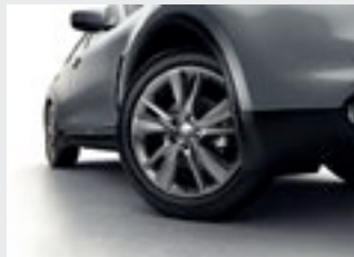
20 x 8.0-INCH ALUMINIUM-ALLOY WHEELS