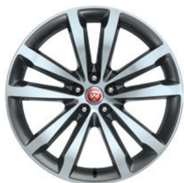
20" 5 SPLIT-SPOKE 'STYLE 5051' WITH SATIN GREY DIAMOND TURNED FINISH