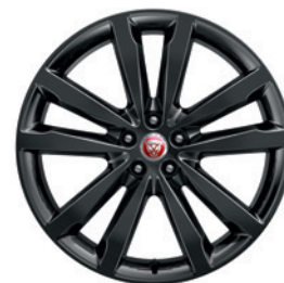
20" 5 SPLIT-SPOKE 'STYLE 5051' WITH GLOSS BLACK FINISH C56N