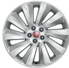
19" 10 SPOKE 'STYLE 1039' Standard on E-PACE SE C56J