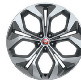
21" 5 SPLIT-SPOKE 'STYLE 5053' WITH SATIN GREY DIAMOND TURNED FINISH C56S