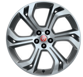
20" 6 SPLIT-SPOKE 'STYLE 6014' WITH SATIN GREY DIAMOND TURNED FINISH*

Search 'Jaguar E-PACE First Edition' for more details.