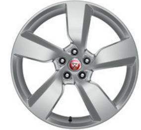
19" 5 SPOKE 'STYLE 5049' Standard on E-PACE R-Dynamic SE C56K