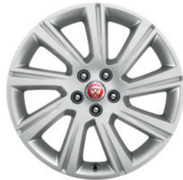
18" 9 SPOKE 'STYLE 9008' Standard on E-PACE S C56G