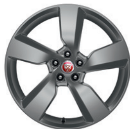
19" 5 SPOKE 'STYLE 5049' WITH SATIN DARK GREY FINISH C69F