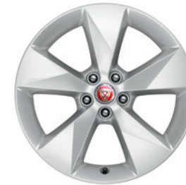
18" 5 SPOKE 'STYLE 5048' Standard on E-PACE R-Dynamic S C56H