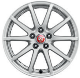
17" 10 SPOKE 'STYLE 1005' Standard on E-PACE and E-PACE R-Dynamic C56W