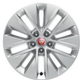
17" 10 SPOKE 'STYLE 1037' C57E