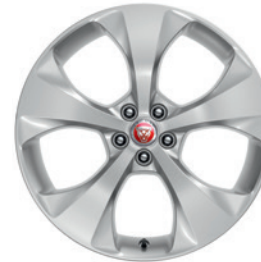
20" 5 SPOKE 'STYLE 5054' Standard on E-PACE HSE C57F