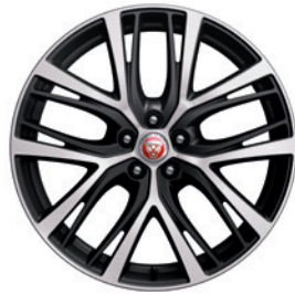
20" 5 SPLIT-SPOKE 'STYLE 5070' IN TECHNICAL GREY WITH POLISHED FINISH 031QS (Standard on First Edition)