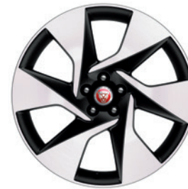
20" 6 SPOKE 'STYLE 6007' WITH DIAMOND TURNED FINISH 031MC