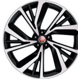
22" 5 SPLIT-SPOKE 'STYLE 5056' WITH DIAMOND TURNED FINISH 031MD