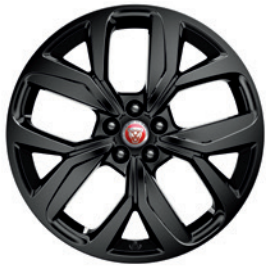
20" 5 SPOKE 'STYLE 5068' WITH GLOSS BLACK FINISH 031QE