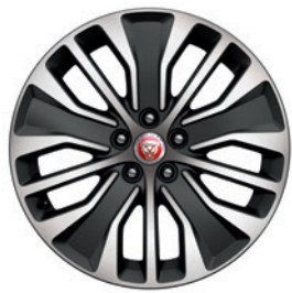
18" 5 SPOKE 'STYLE 5055' WITH DIAMOND TURNED FINISH 031TC