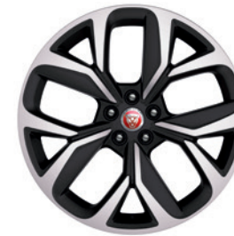
20" 5 SPOKE 'STYLE 5068' WITH DIAMOND TURNED FINISH 031QD (Standard on HSE)