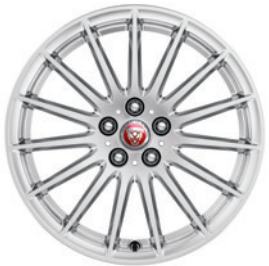
18" 15 SPOKE 'STYLE 1022' 029YH (Standard on S)