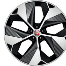
22" 5 SPOKE 'STYLE 5069' IN GLOSS BLACK WITH DIAMOND TURNED FINISH AND CARBON INSERTS 031QT