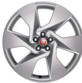
20" 6 SPOKE 'STYLE 6007' 031MB (Standard on SE)