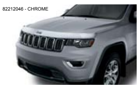
CHROME FRONT AIR DEFLECTOR, Deflect road HITCH-MOUNT BIKE CARRIER, Hitch-mount debris, dirt and insects away from your vehicle's hood and windshield with this easily installed accessory. The wraparound style creates an air stream to help direct develocle's liftgate to open without having to remove bikes. safely and easily, and is compatible with all Mopar® Sport to the Sport Utility Bars or Removable Roof Rack Kit. bris up and away from the hood.