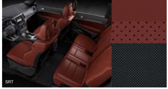
Black & Dark Ruby Red Laguna Leather (Option - SRT)