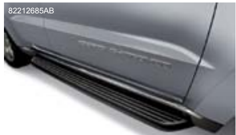
MOLDED RUNNING BOARDS. These premium ILLUMINATED DOOR SILL GUARDS. Add a BRIGHT PEDAL KIT. Stainless steel pedal covers running boards are constructed of heavy-gauge steel, touch of stainles ssteel style to your vehicle while protect- add bold brightwork to your footwell. Rubber inserts on aiding in safe, easy entry and exit from your vehicle. ing its interior door sills from scratches. The Jeep® Brand pedals provide positive traction. No drilling required.