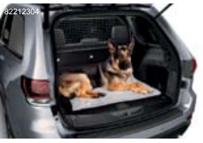
CARGO BARRIER. Minimize distractions when you travel and keep your four-footed family member safely restricted to the rear cargo area of your Grand Cherokee. This adjustable, low-glare, black steel barrier is custom- interior carpet. The mat is easy to remove for cleaning. fitted and ready to install.