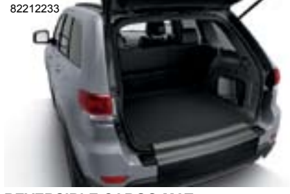
fit cargo mat features a rubberized side to prevent cargo opening and, when properly equipped with weight-dis-your vehicle's existing exhaust system with this easily infrom sliding and a soft fabric side to protect your vehicle's tributing equipment, allows it to tow up to 2812kg (4x4 stalled accessory. The chrome tip adds a polished finish