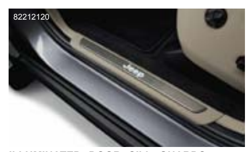
Boards feature a Black outer cover with chrome accents. logo illuminates when the door is opened. Designed to enhance Limited, Overland® and Summit® models.