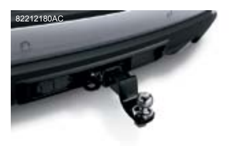
REVERSIBLE CARGO MAT. This non-slip, custom- HITCH RECEIVER. Receiver features a two-inch CHROME EXHAUST. Enhance the appearance of 3.6L engine), 3500kg (4x4 3.0L engine) & 2949kg (6.4L and touch of class. engine). Please refer to Owner's Manual for safe use.