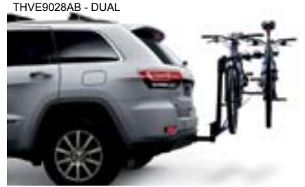
Carrier features carrying clamps and security cable.