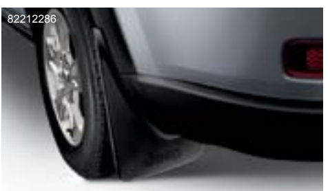
MOLDED SPLASH GUARDS. Designed to help protect your Grand Cherokee's body panels by deflecting gravel, salt and other road debris. Guards feature the Jeep® Brand logo.