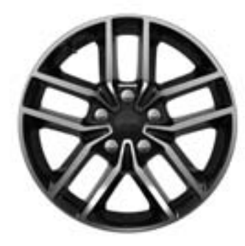
18-Inch Off-Road Alloy Wheels (Standard - Trailhawk)