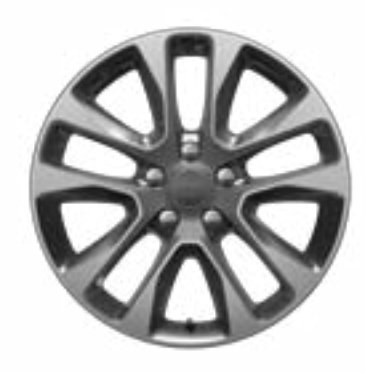
20-Inch Alloy Wheels (Standard - Overland)