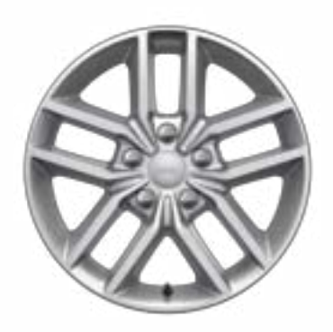
18-Inch Alloy Wheels (Standard - Laredo)