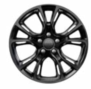
20-Inch Satin Carbon Forged Alloy Wheels (Option - SRT)