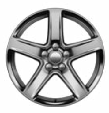
20-Inch Forged Alloy Wheels (Standard - SRT)