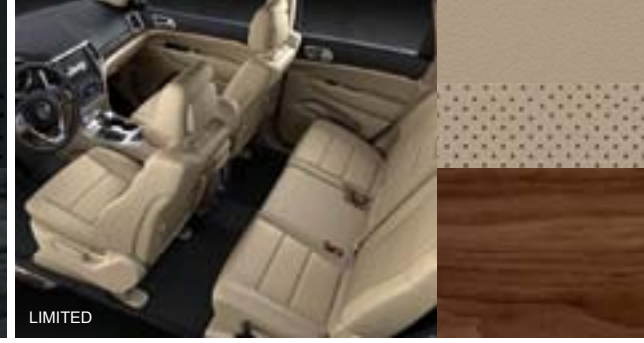
Black & Light Frost Beige Nappa Leather (Option - Limited)