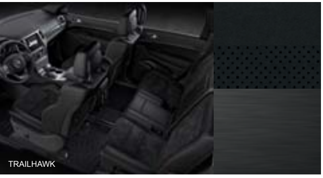
Black Nappa Leather with Suede & Red Accent Stitch (Standard - Trailhawk)