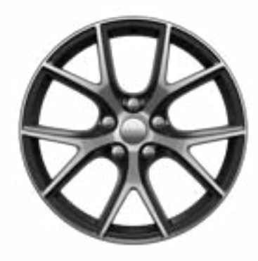
20-Inch Light-Weight Forged Alloy Wheels (Option - SRT)