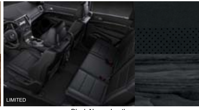
Black Nappa Leather (Option - Limited)