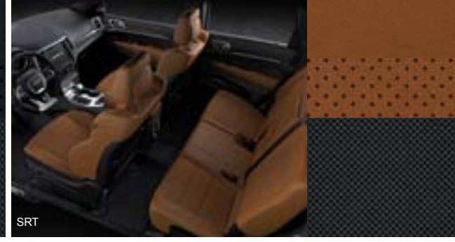
Black & Sepia Leather with Suede (Option - SRT)