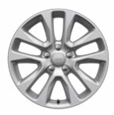
20-Inch Alloy Wheels (Standard - Limited)