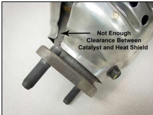
Noise can occur with less than 3mm clearance between catalyst and heat shield.