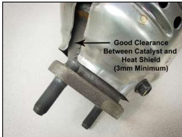
Good clearance of more than 3mm.