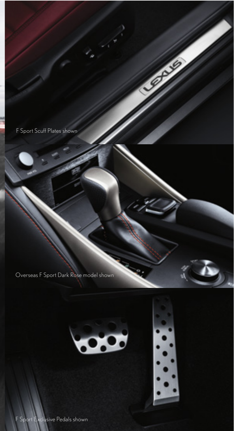
F Sport Scuff Plates shown