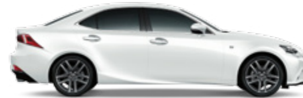
White Nova^ - F Sport only