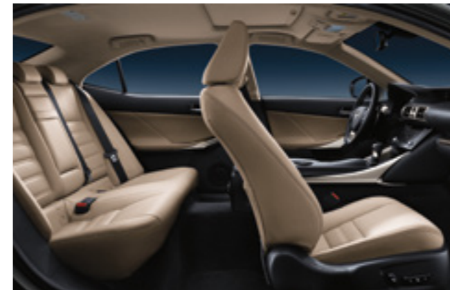
Ivory Trim Overseas model shown

Lexus Australia reserves the right to vary and discontinue the current interior and exterior colours, trims and colour/trim/model combinations. Colours and trims displayed here are a guide only and may vary from actual colours due to printing/display process. See your Lexus dealer to confirm colour/trim/model availability when ordering your vehicle.