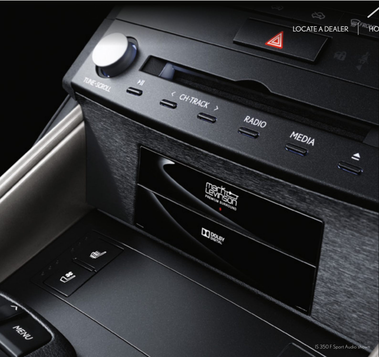
IS 350 F Sport Audio shown