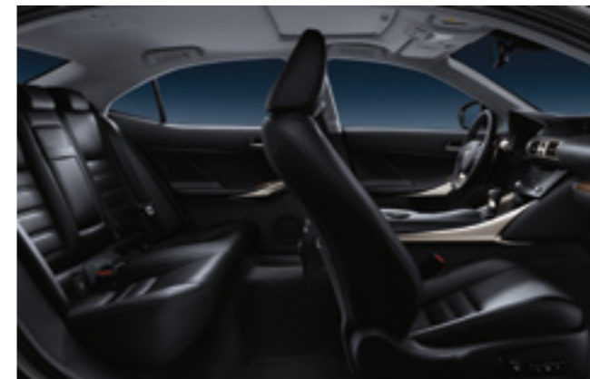
Black Trim Overseas model shown