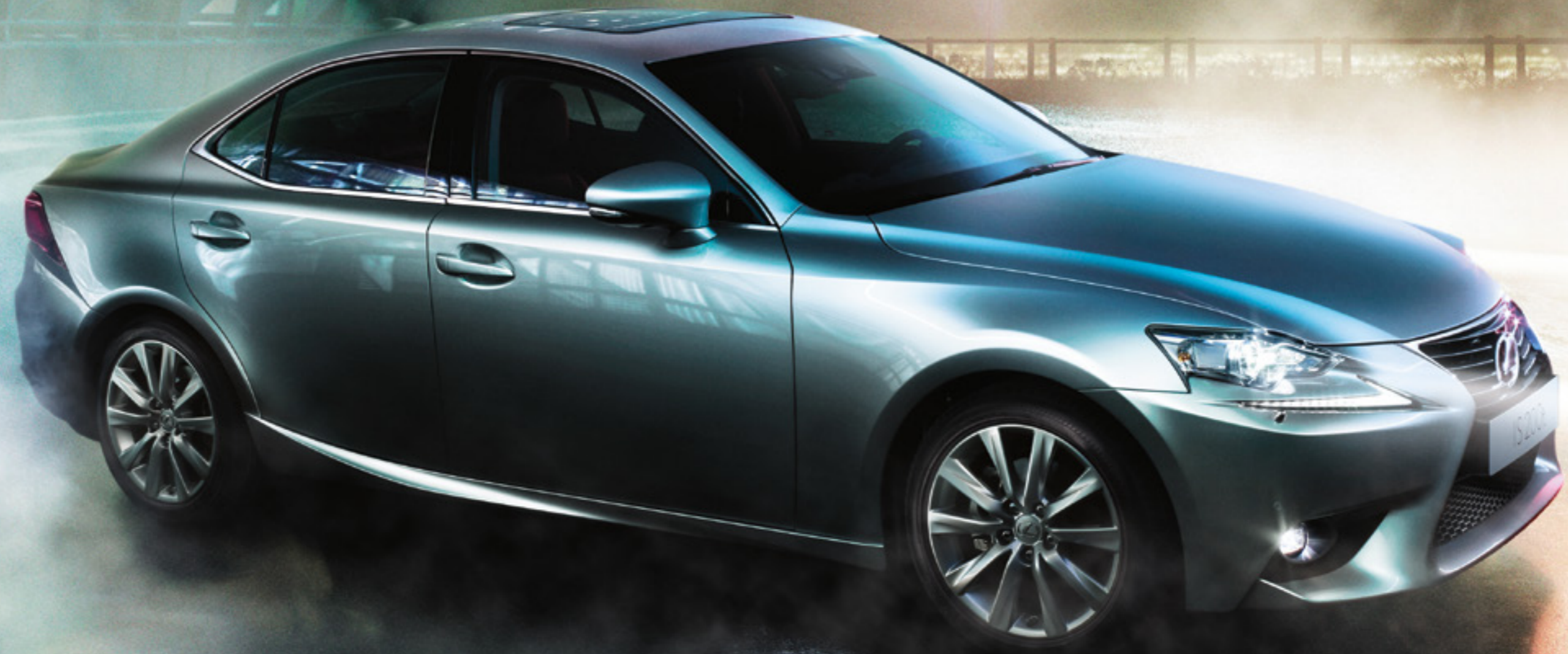
Overseas IS 200t Luxury model with Enhancement Pack 1 shown