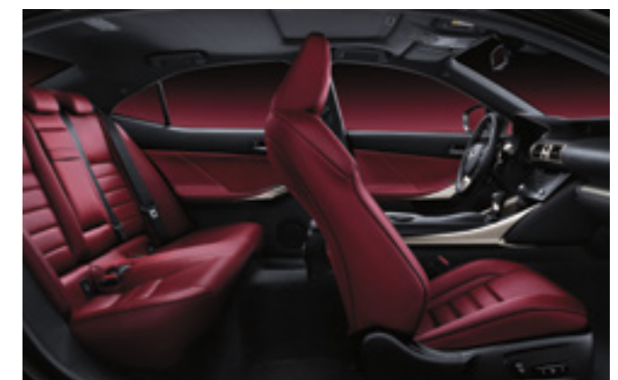
Dark Rose Trim (F Sport models only) Overseas model shown