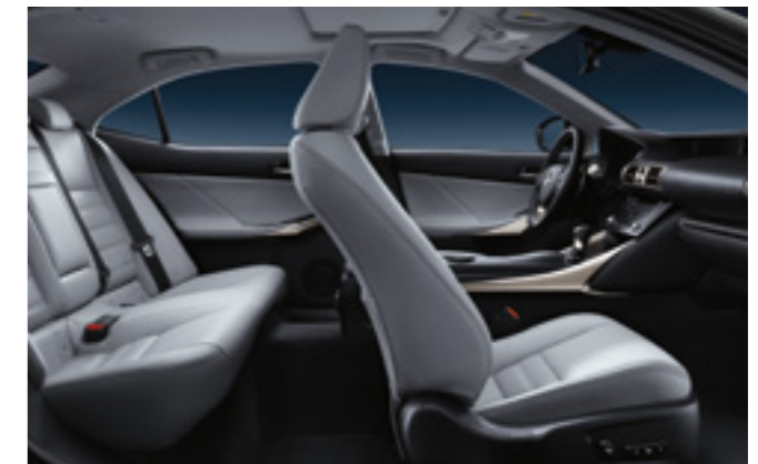
Moonstone Trim Overseas model shown