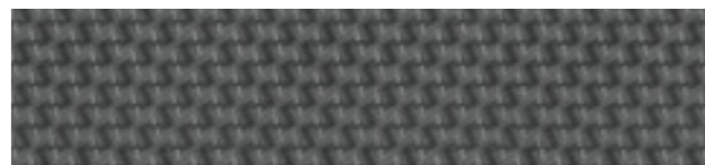
Wedge Metal (F Sport models only)