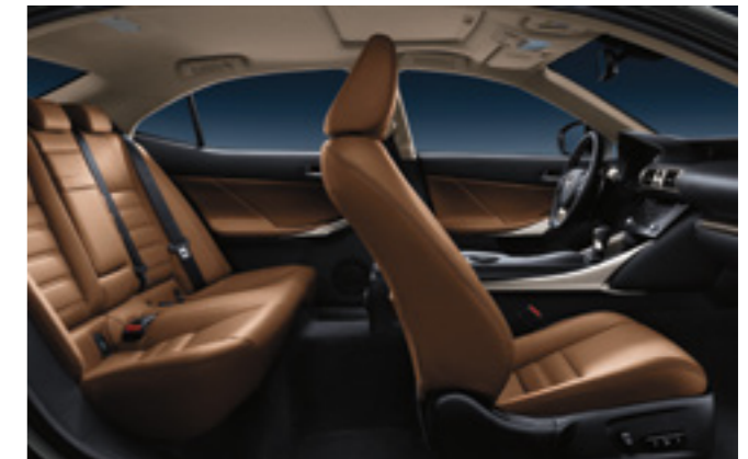
Topaz Brown Trim Overseas model shown