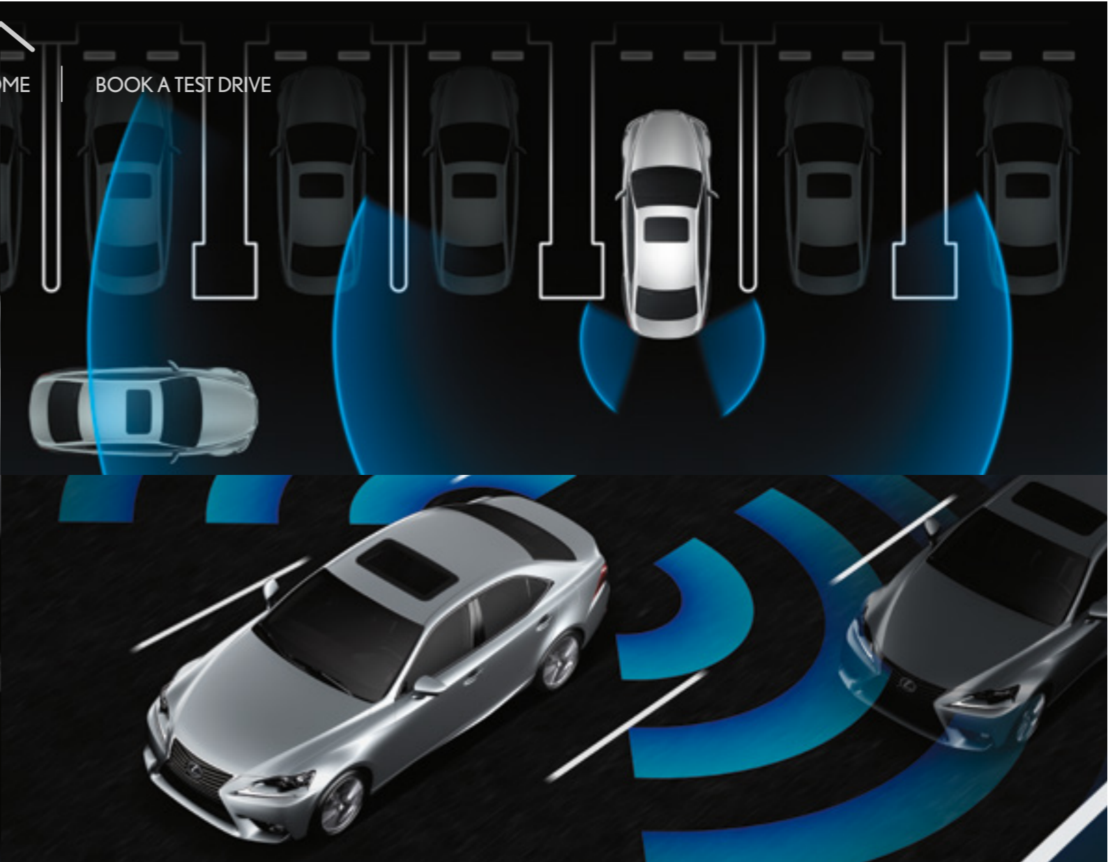
Overseas IS 300h Sports Luxury model shown