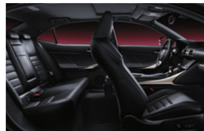
Black Trim (F Sport models only) Overseas model shown