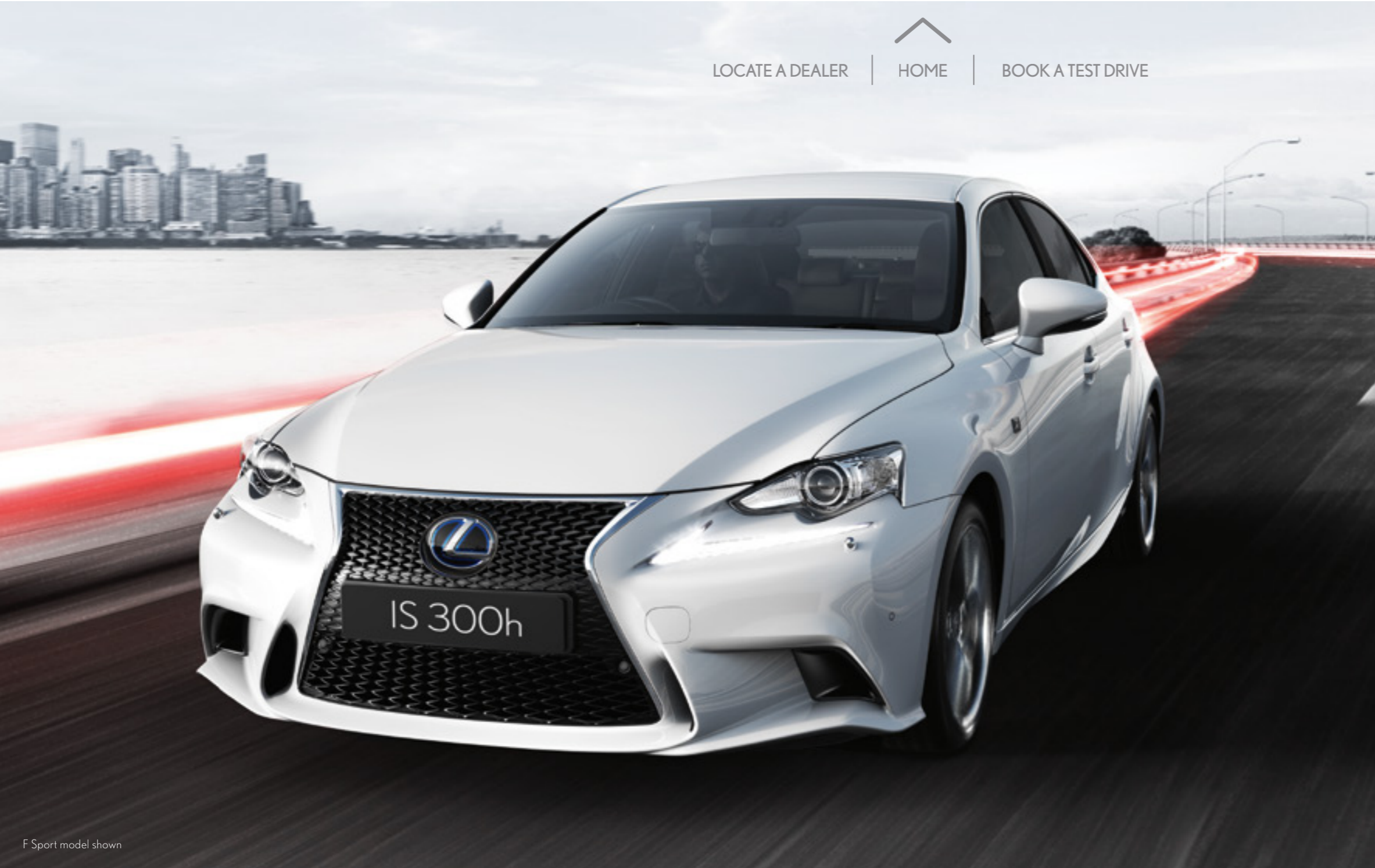
F Sport model shown