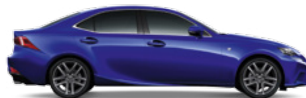
Cobalt Mica^ - F Sport only