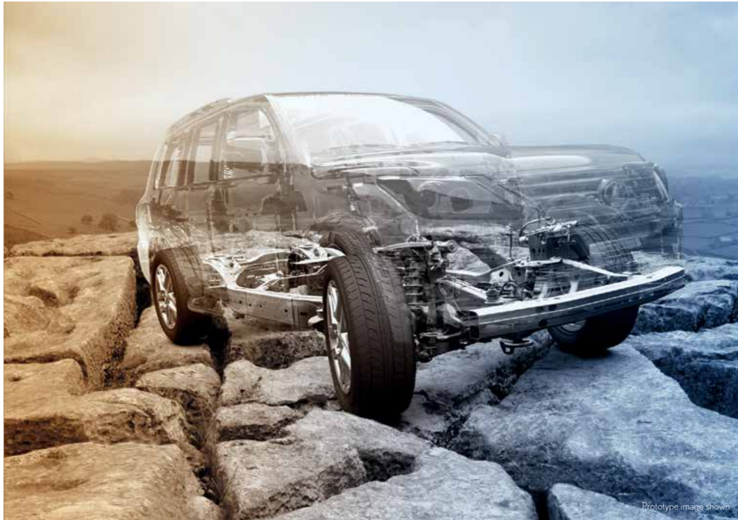
Prototype image shown

Confidence is what allows us to drive out of our comfort zones. The vision of Lexus engineers was to create a vehicle that gives you the certainty, through cutting-edge safety innovations, to venture even further – naturally, without compromising on luxury along the way.