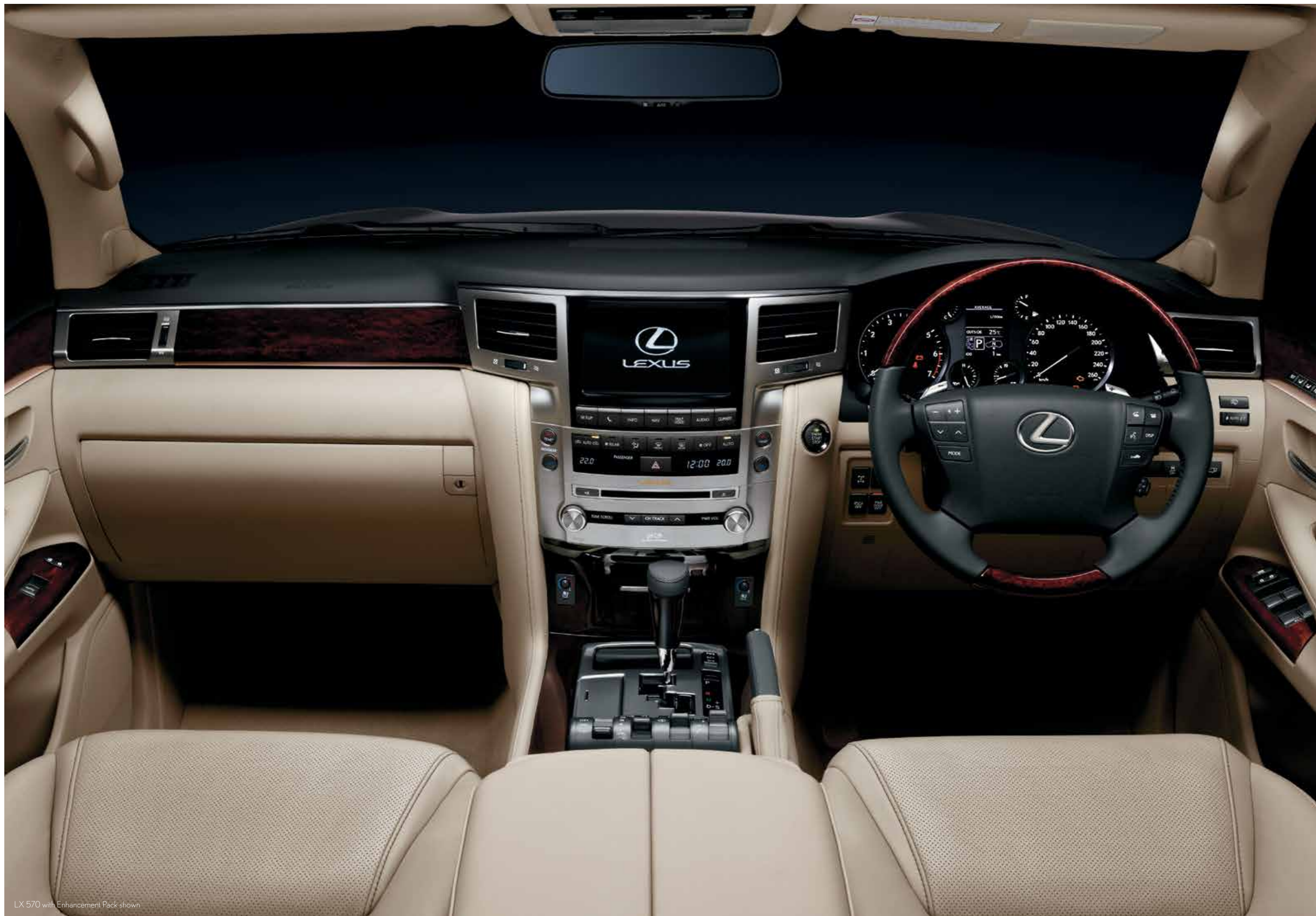
LX 570 with Enhancement Pack shown