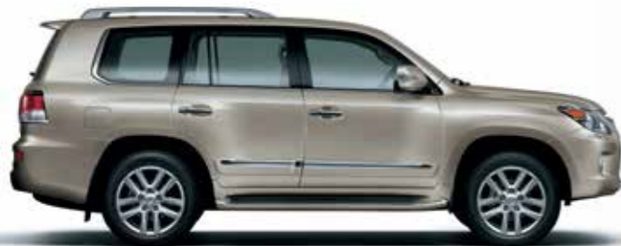
4U7 Metallic Silk ^