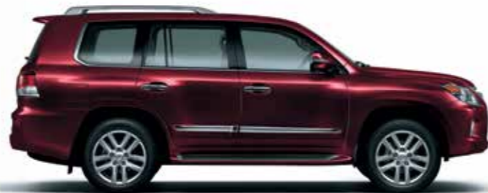
350 Garnet ^