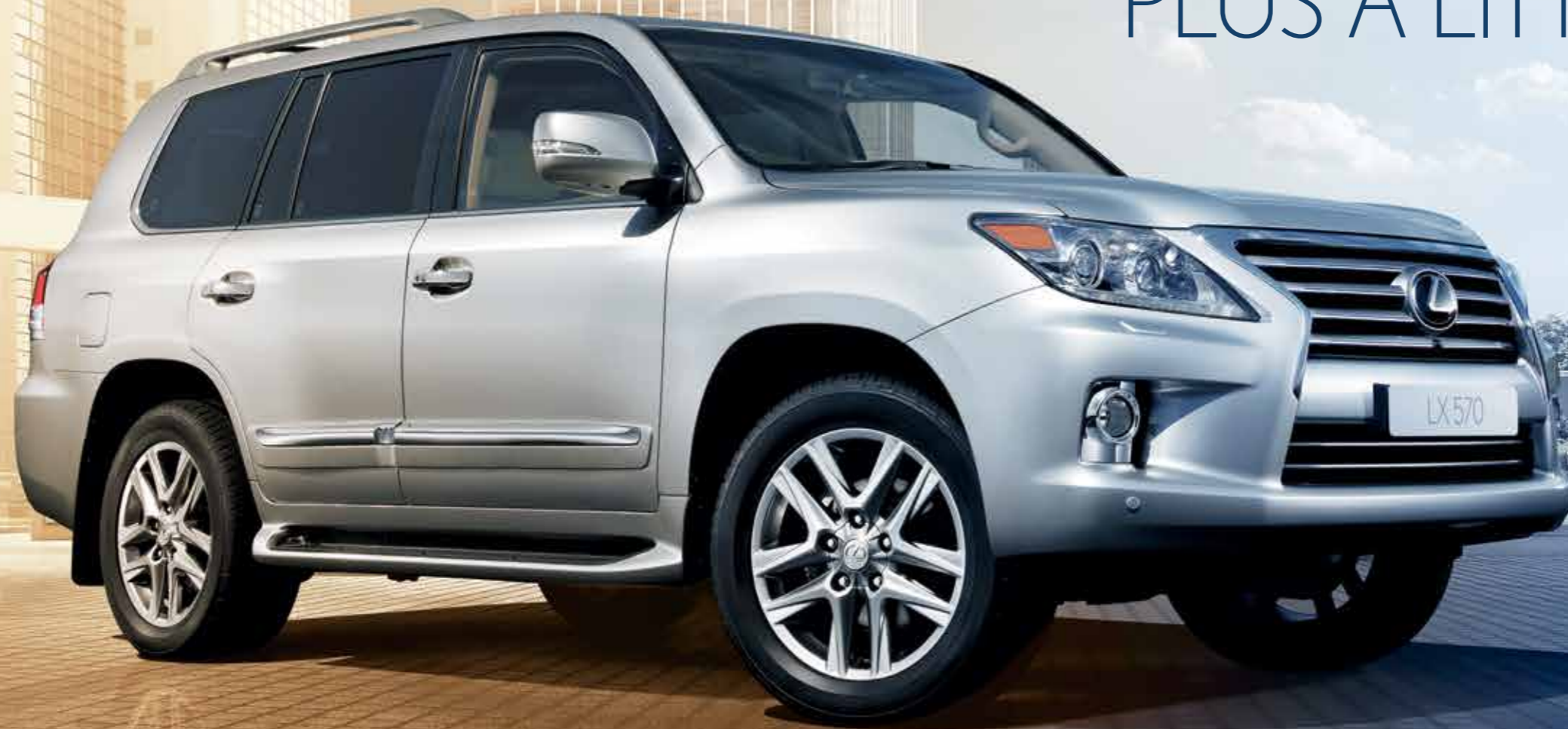
LX 570 with Enhancement Pack shown

EVER WANTED TO HAVE IT ALL, PLUS A LITTLE MORE?