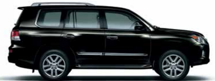
217 Starlight Black ^