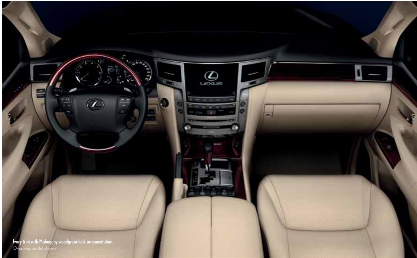
Ivory trim with Mahogany woodgrain-look ornamentation. Overseas model shown

Lexus designers have created an interior that evokes a feeling of contentment amid the excitement of a vehicle that has the ability to conquer rugged terrain.