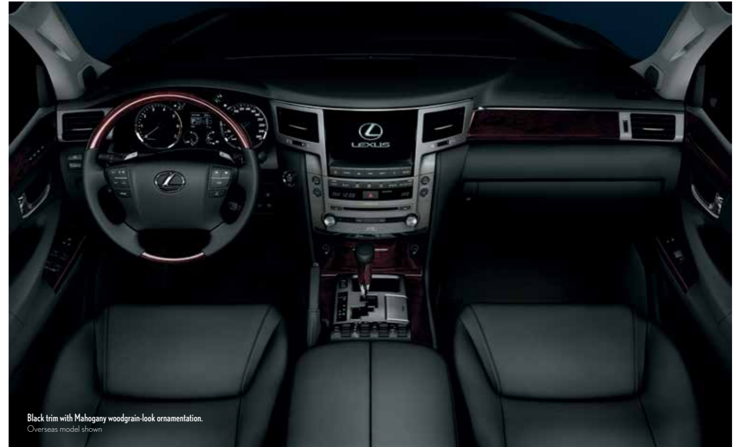
Black trim with Mahogany woodgrain-look ornamentation. Overseas model shown

Lexus designers have created an interior that evokes a feeling of contentment amid the excitement of a vehicle that has the ability to conquer rugged terrain.