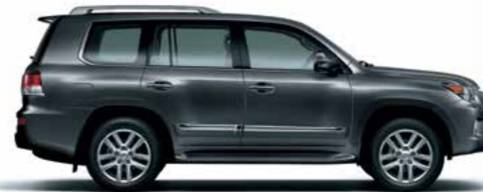
1H9 Mercury Grey ^