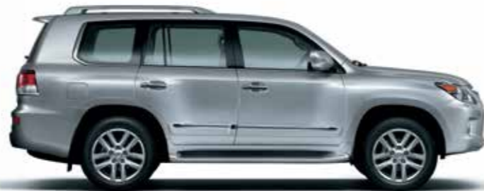
114 Premium Silver ^