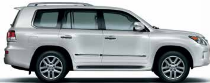
077 White Pearl ^