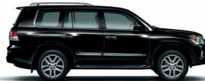
202 Classic Black

Colour is emotion in action. It evokes warmth and contentment, and inspires excitement and anticipation.