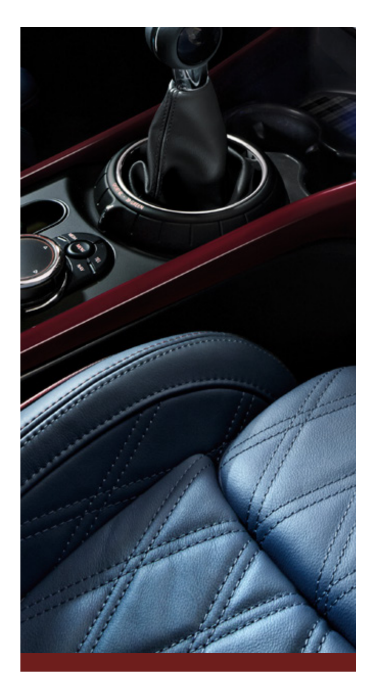
Electric seat adjustment has a memory function, allowing drivers to save their favourite seat position.