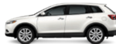
Crystal White Pearl