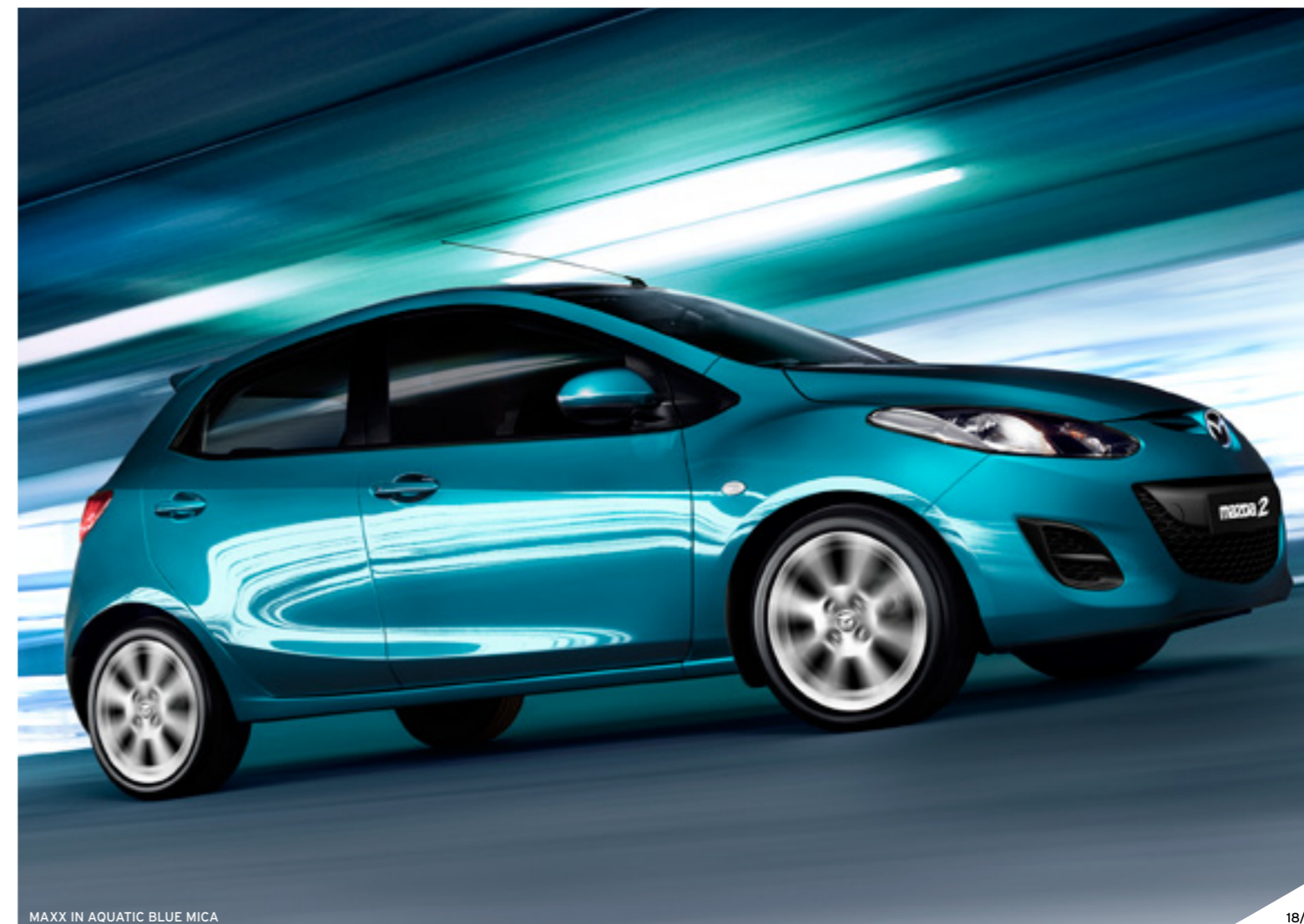
MAXX IN AQUATIC BLUE MICA