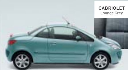
OCEAN BLUE (P) (COLOUR NOT AVAILABLE IN TURBO MODEL)