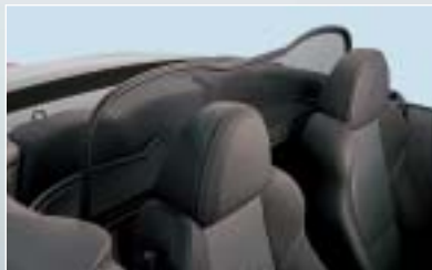
WIND DEFLECTOR (OPTIONAL ACCESSORY)

Metallic (M) and Pearlescent (P) paints are optional extras.