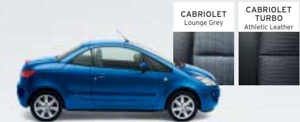
RACE BLUE (P)

Metallic (M) and Pearlescent (P) paints are optional extras.