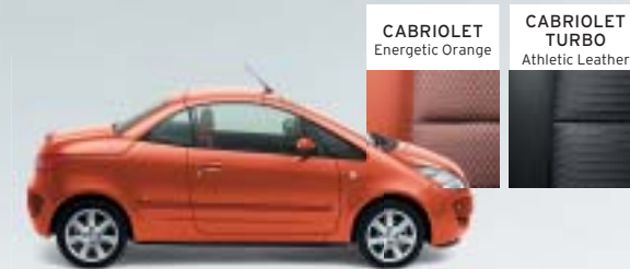
ORIENTAL ORANGE (P)