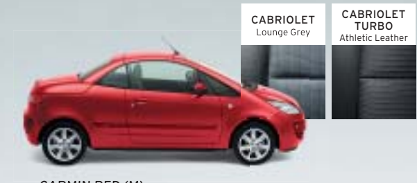
CARMIN RED (M)