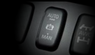
Manual intercooler water spray.