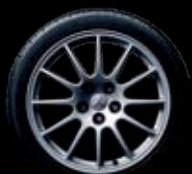
18" ENKEI alloy wheels.

Premium Rockford Fosgate® audio system (single disc player) 9 speakers including subwoofer and auxiliary input