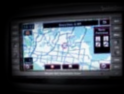
Mitsubishi Multi Communication System.