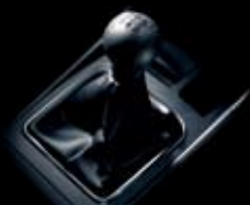
5 speed manual transmission.