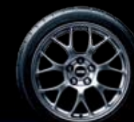
18" BBS forged aluminium wheels.