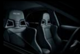
Leather combination seat trim.