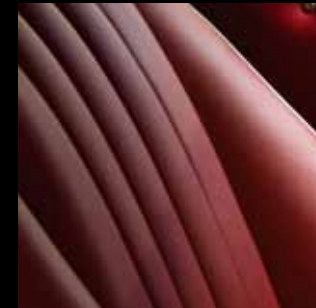
Several leather choices