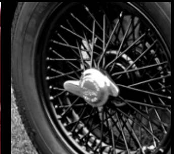
Black wire wheels