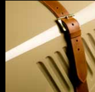
Bonnet strap detail

Whichever route you choose the excitement will begin the day you decide to buy a Morgan sports car.