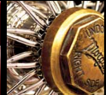
Polished wire wheels