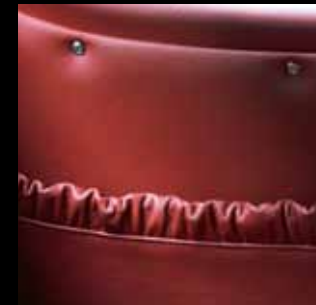
Tan or black leather