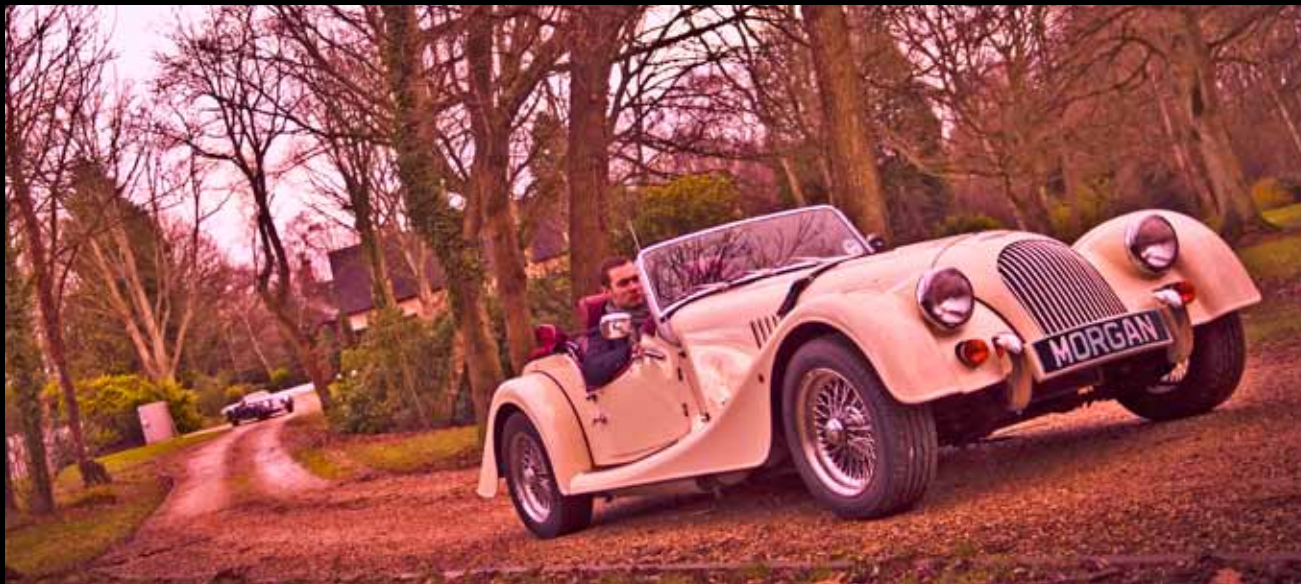
Bespoke specification Plus 4