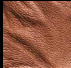
Saddle Brown Leather