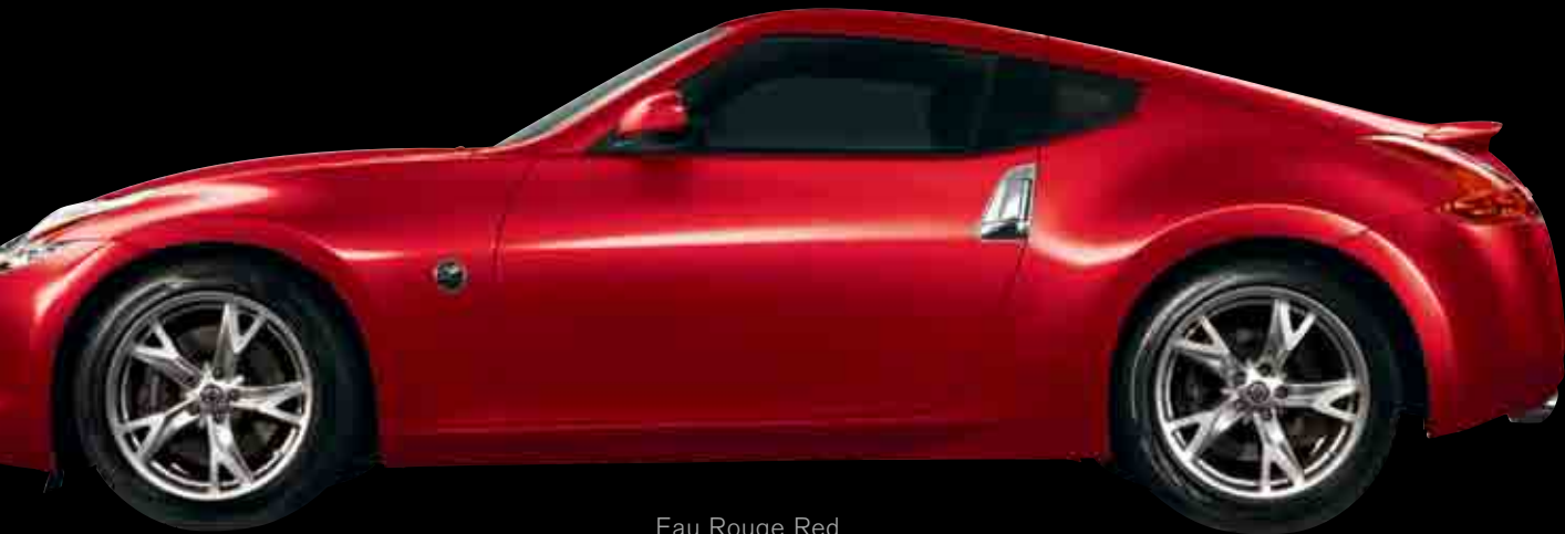
Eau Rouge Red