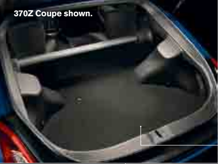
370Z Coupe shown.