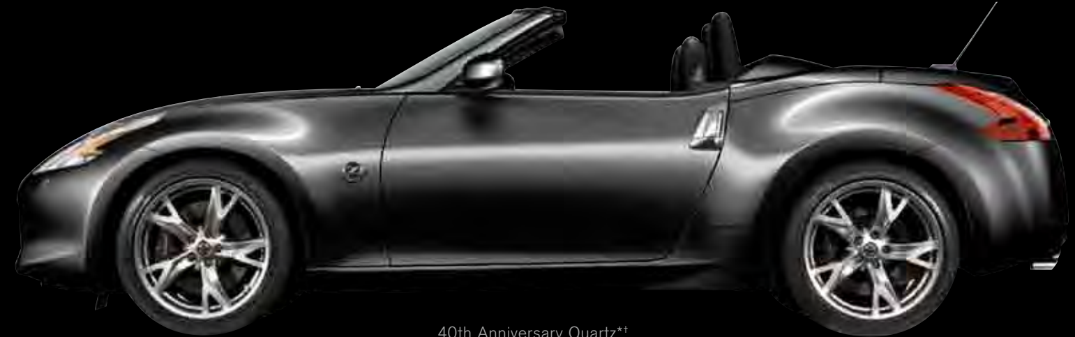
40th Anniversary Quartz**