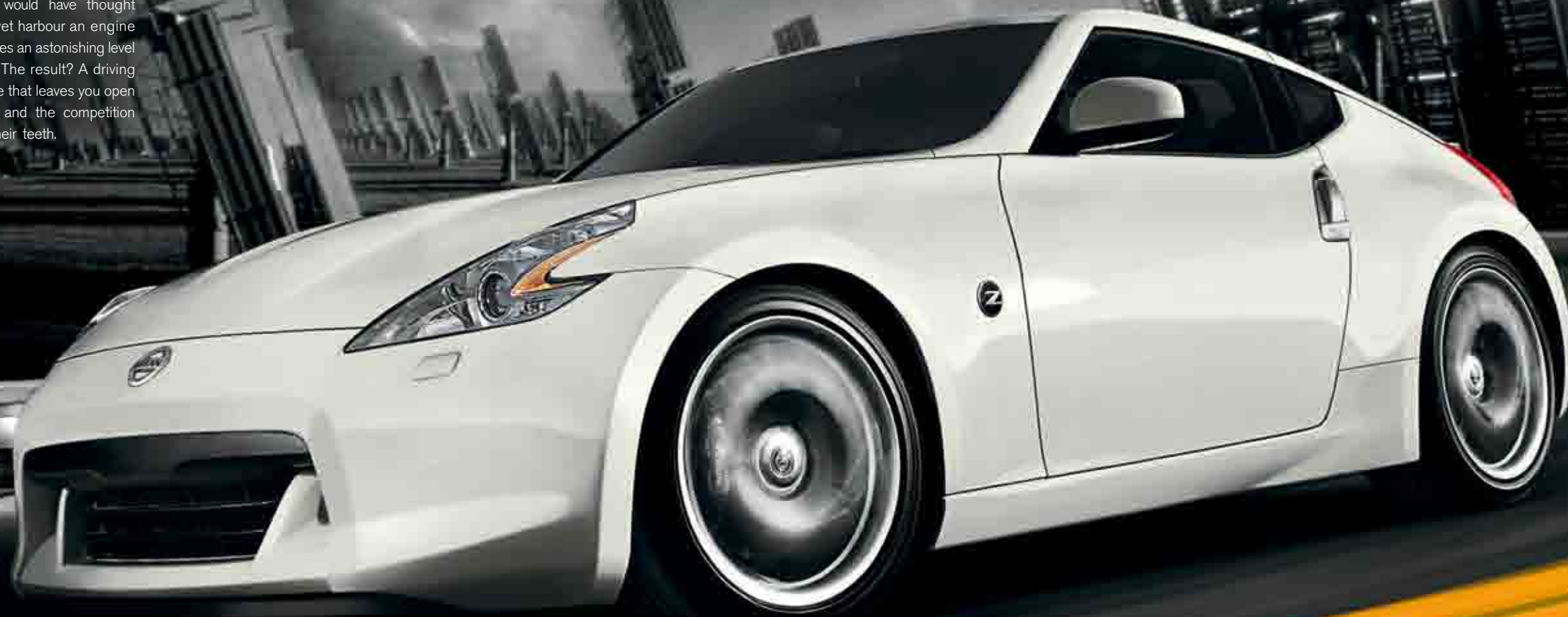
Shiro White Coupe shown.

Just look at it. Here is a car that appears ready to pounce even before the engine starts. Yet its sleek, eager curves aren't merely for show. Every contour and every design element is focused on providing just one thing; a blistering, exhilarating, breathtaking performance. The 370Z's aggressive stance has been honed through decades of Nissan sportscar design and engineering. These cars are lighter than you would have thought possible, yet harbour an engine that provides an astonishing level of power. The result? A driving experience that leaves you open-mouthed and the competition grinding their teeth.