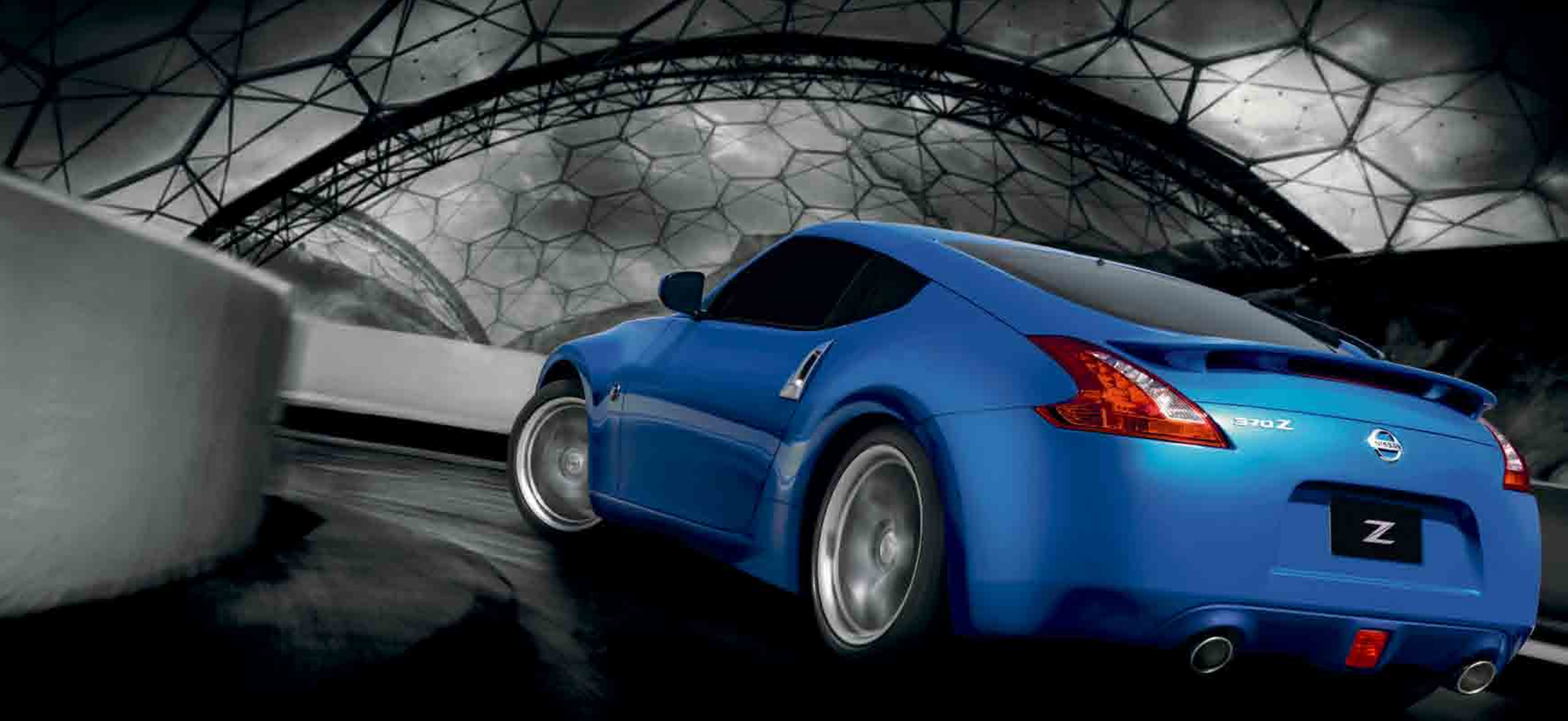
Monterey Blue Coupe shown.