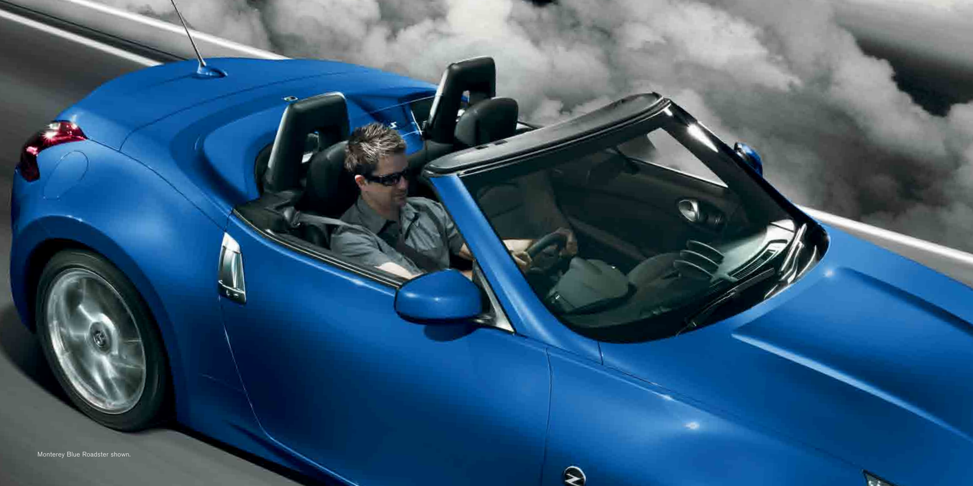
Monterey Blue Roadster shown.