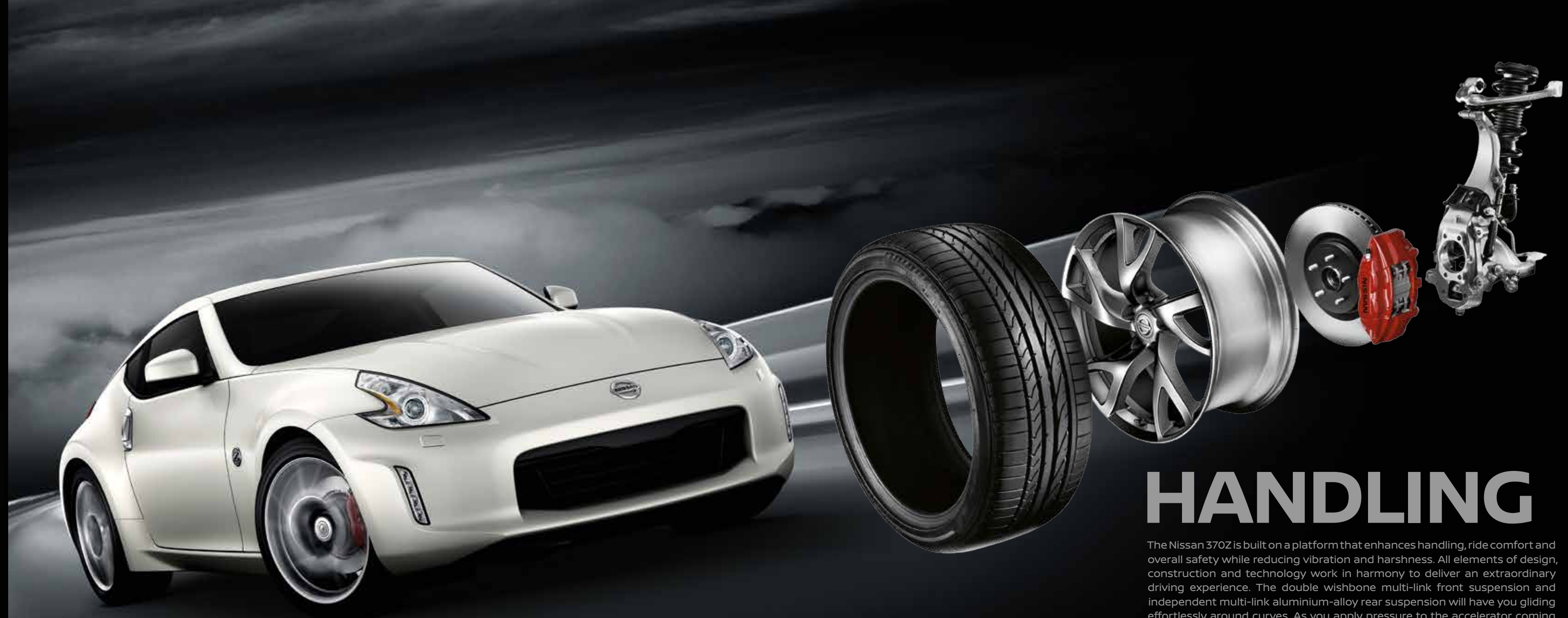
Shiro White Coupe shown.