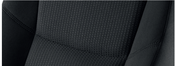
Cloth seat trim. Available on ST only.

S Standard paint P Premium paint available at extra cost