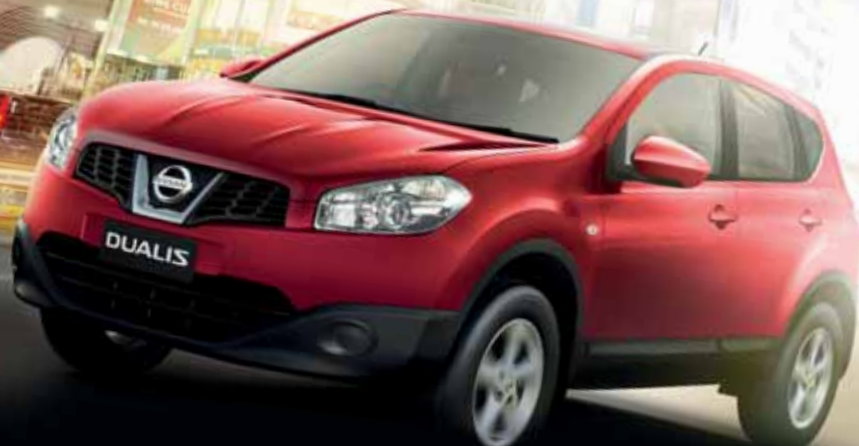
Flame Red ST Hatch.

myNissan is a complete ownership experience , which helps you get the most out of your Nissan. As part of myNissan, you will receive a 3 year/100,000km warranty and have access to 24-Hour Roadside Assistance for 3 years. No matter what journey you're planning, you'll have the peace of mind in knowing that if you lock your keys in the car, have a flat tyre or battery, or run out of fuel, we'll help get you back on the road at no charge. You can also take the option to extend your warranty for up to 6 years.