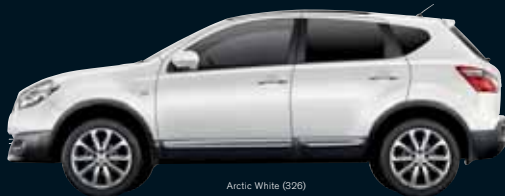
Arctic White (326)