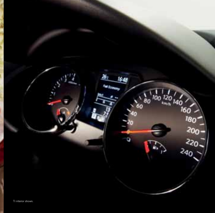
Ti interior shown.