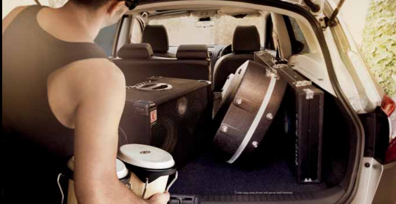
Ti rear cargo area shown with parcel shelf removed.