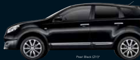
Pearl Black (Z11)*

In some cases the printed colours may vary from the actual paint colours. *Indicates a metallic paint, which is available at extra cost.