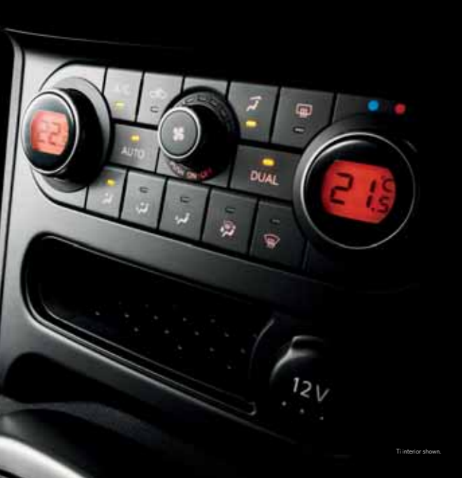
Ti interior shown.