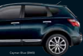
Cayman Blue (BW9)