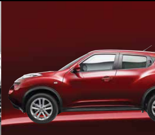
Cayenne Red (NAH)*