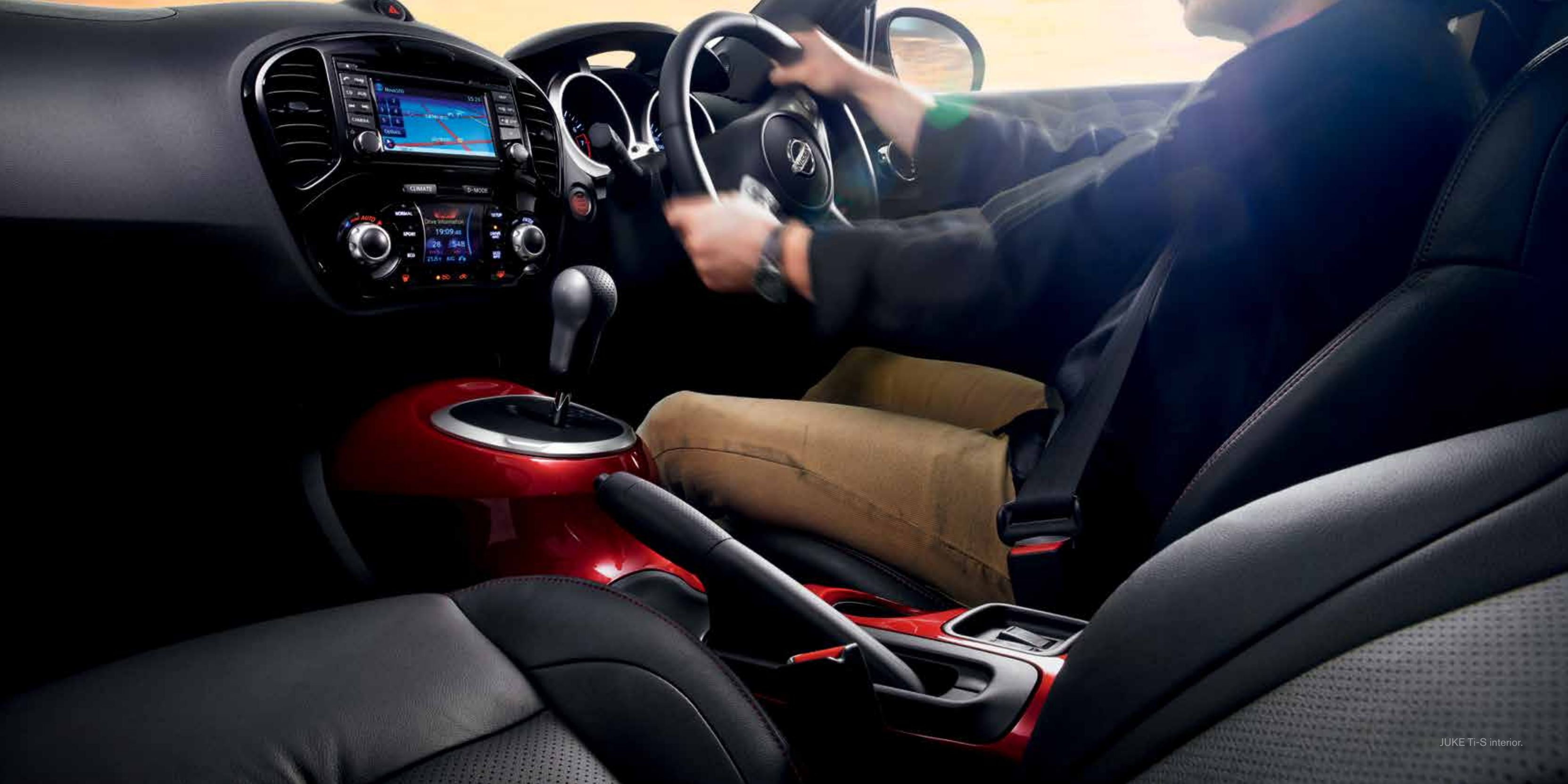
JUKE Ti-S interior.