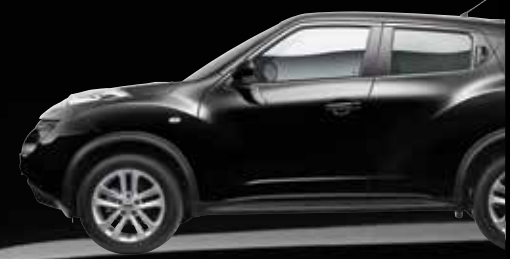
Pearl Black (Z11)