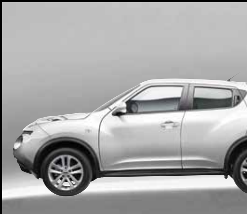
Ivory Pearl (QAB)