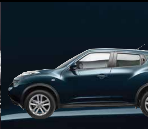
Tempest Blue (RAO)**