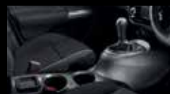
Grey interior trim & console (manual shown). Comes standard.