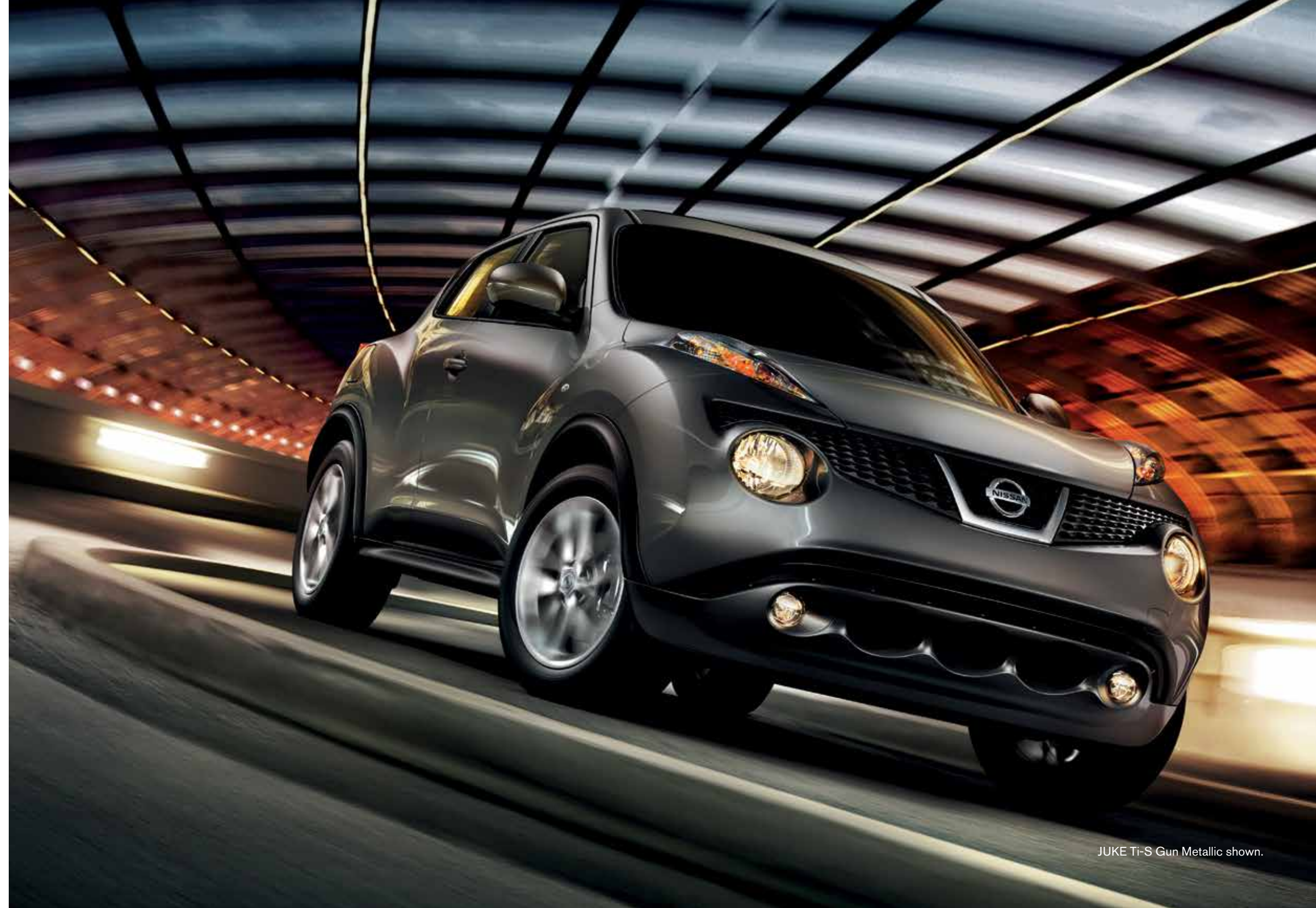
JUKE Ti-S Gun Metallic shown.