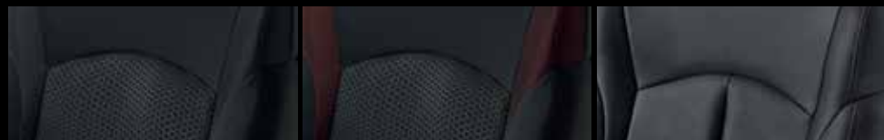
Premium Black cloth with grey accents