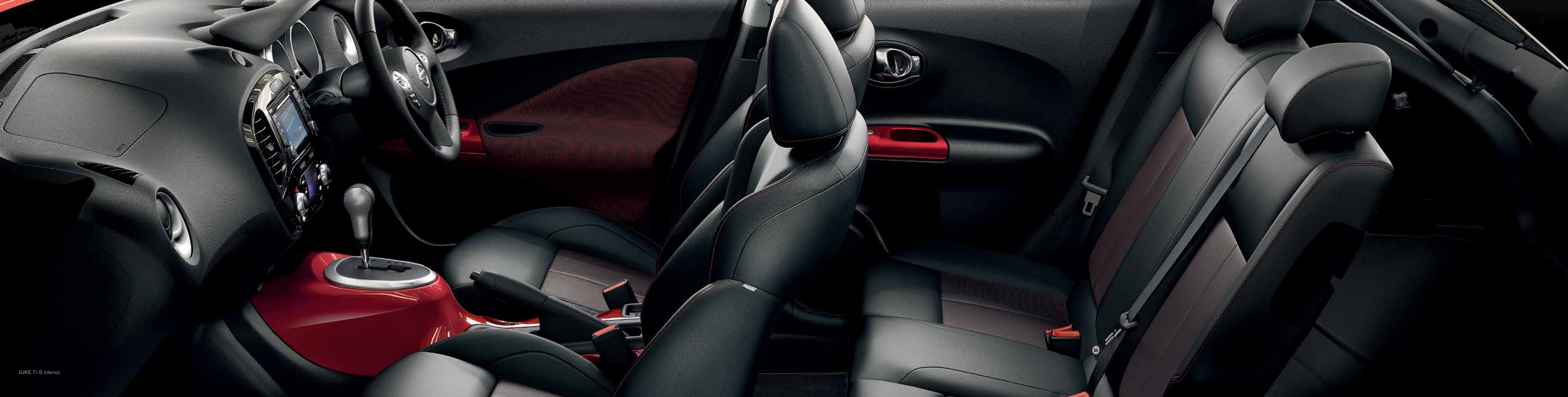
JUKE Ti-S interior.