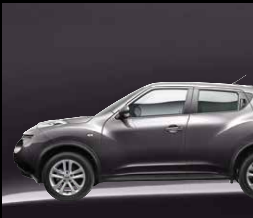
Gun Metallic (KAD)*