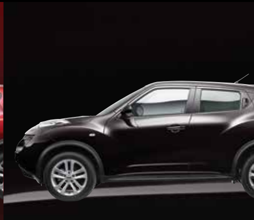
Coyote Brown (KAX)**