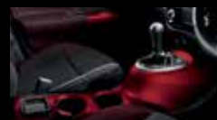
Red interior trim & console (manual shown).^