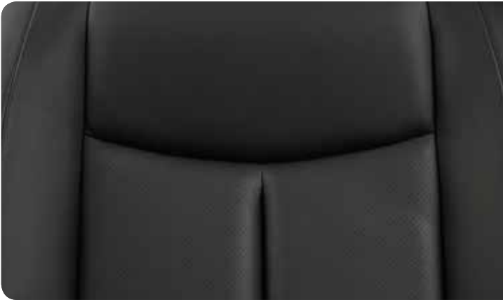
Black leather seat trim.

*GVM = Gross Vehicle Mass, GVM includes the driver, passengers, full fuel tank and luggage. <sup>4</sup>Figures have been calculated in accordance with ADR81/02. Actual fuel consumption will vary depending on driving conditions, driver behaviour, the condition of your vehicle and the accessories fitted.