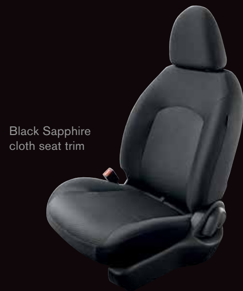
Black Sapphire cloth seat trim

# Colour to be discontinued from August 2013 production. Please check latest availability with your authorised Nissan dealer at time of purchase.