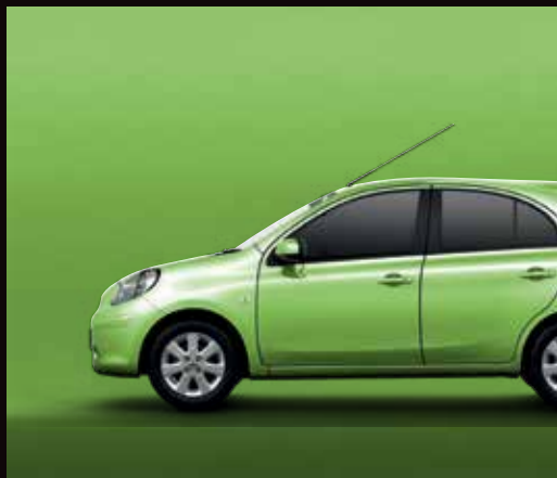
Glasgow Green (JAD)**