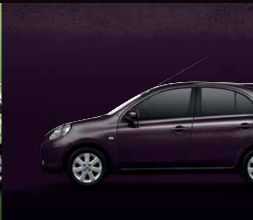
Prague Nightshade (GAB)*