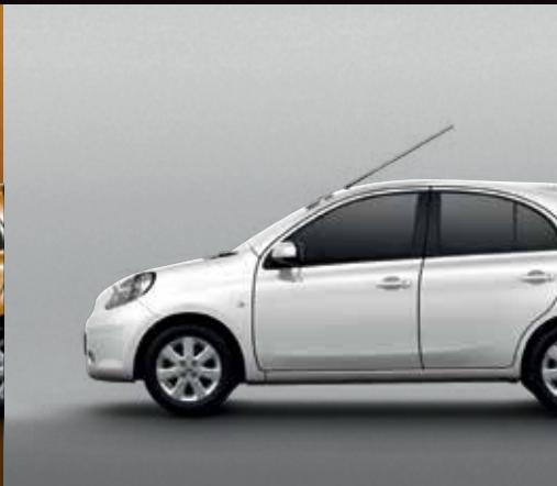
Geneva White (QX1)