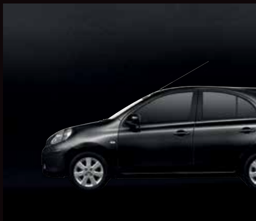
Boston Black (KH3)