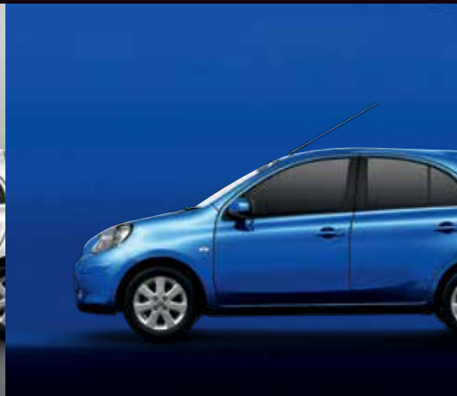
Berlin Blue (B53)*