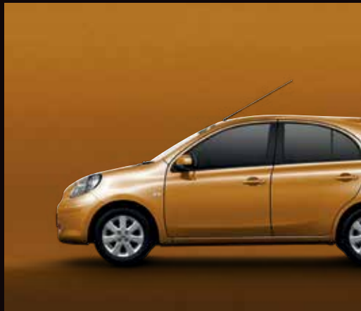
Amsterdam Orange (A55)**