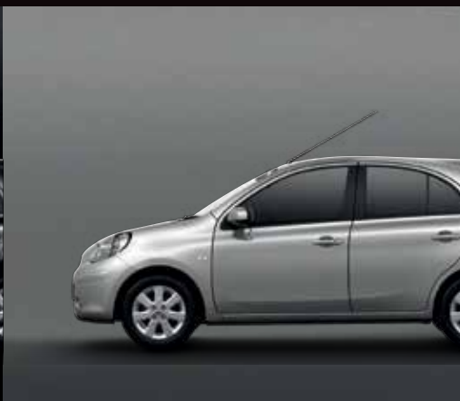
Monaco Platinum (K23)*