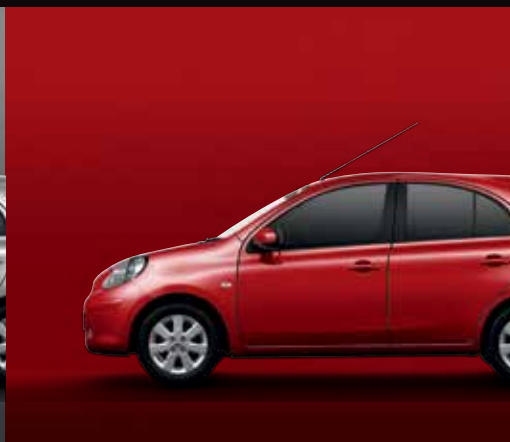
Roma Red (AY4)*