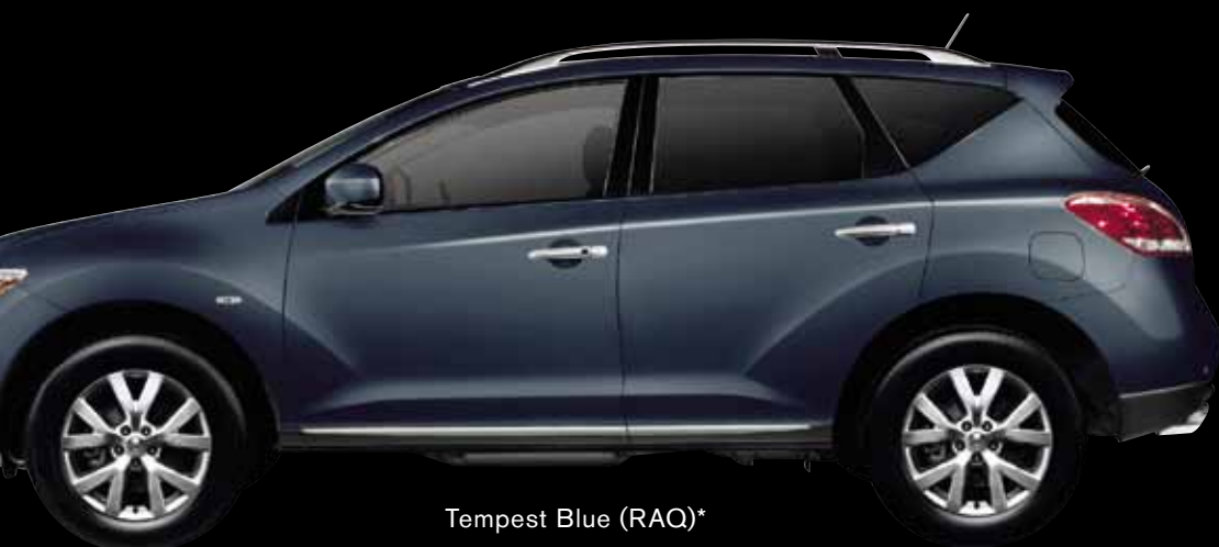
Tempest Blue (RAQ)*