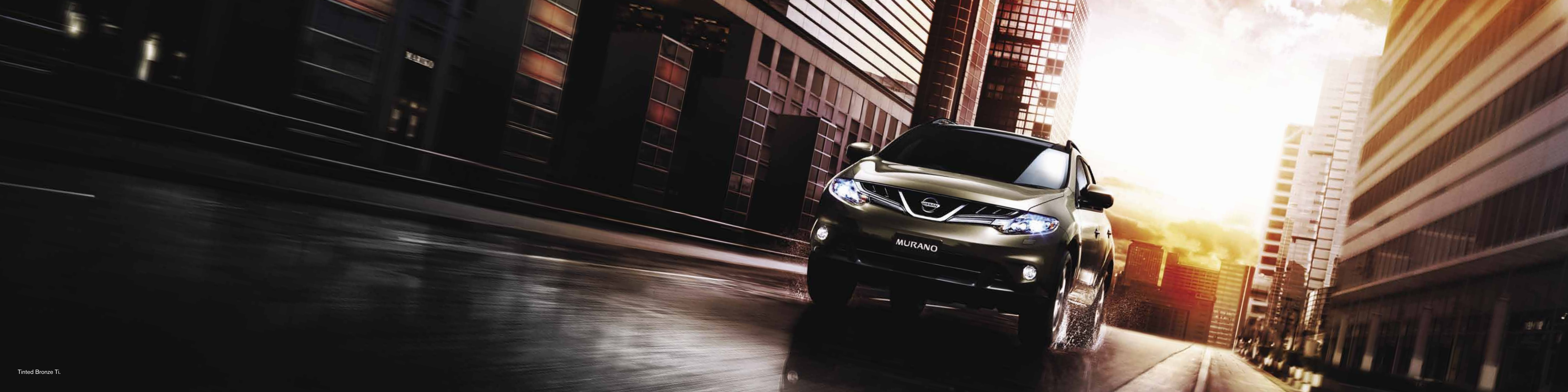
Tinted Bronze Ti.