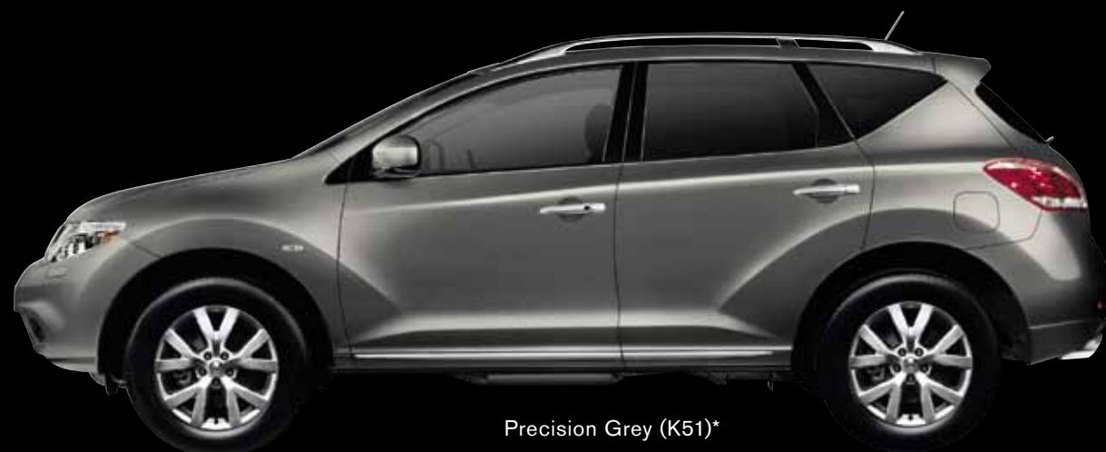
Precision Grey (K51)*