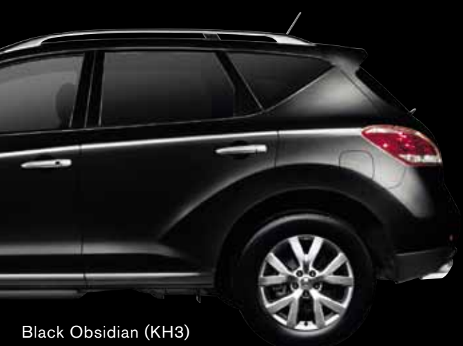
Black Obsidian (KH3)