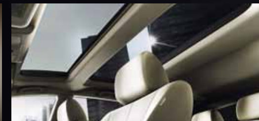
Dual glass panoramic sunroof.*