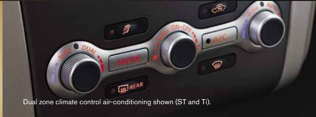
Dual zone climate control air-conditioning shown (ST and Ti).