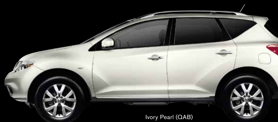
Ivory Pearl (QAB)