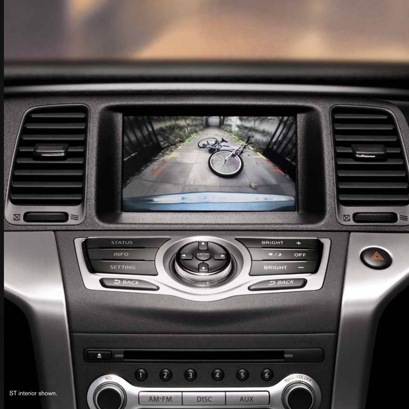
ST interior shown.