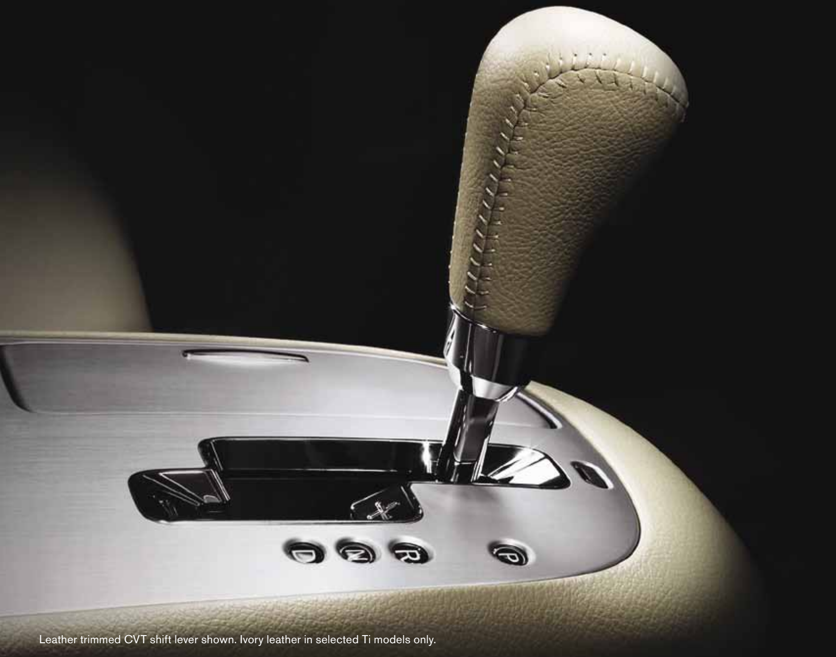
Leather trimmed CVT shift lever shown. Ivory leather in selected Ti models only.