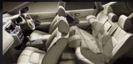
Power flip-up rear seats.*

Enjoy programmable settings for you and a second driver, so your favourite seating, mirror and steering wheel position are remembered at the touch of a button.