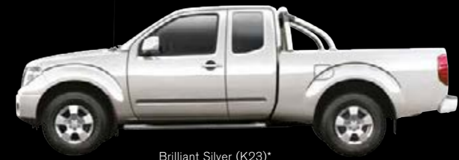
Brilliant Silver (K23)*