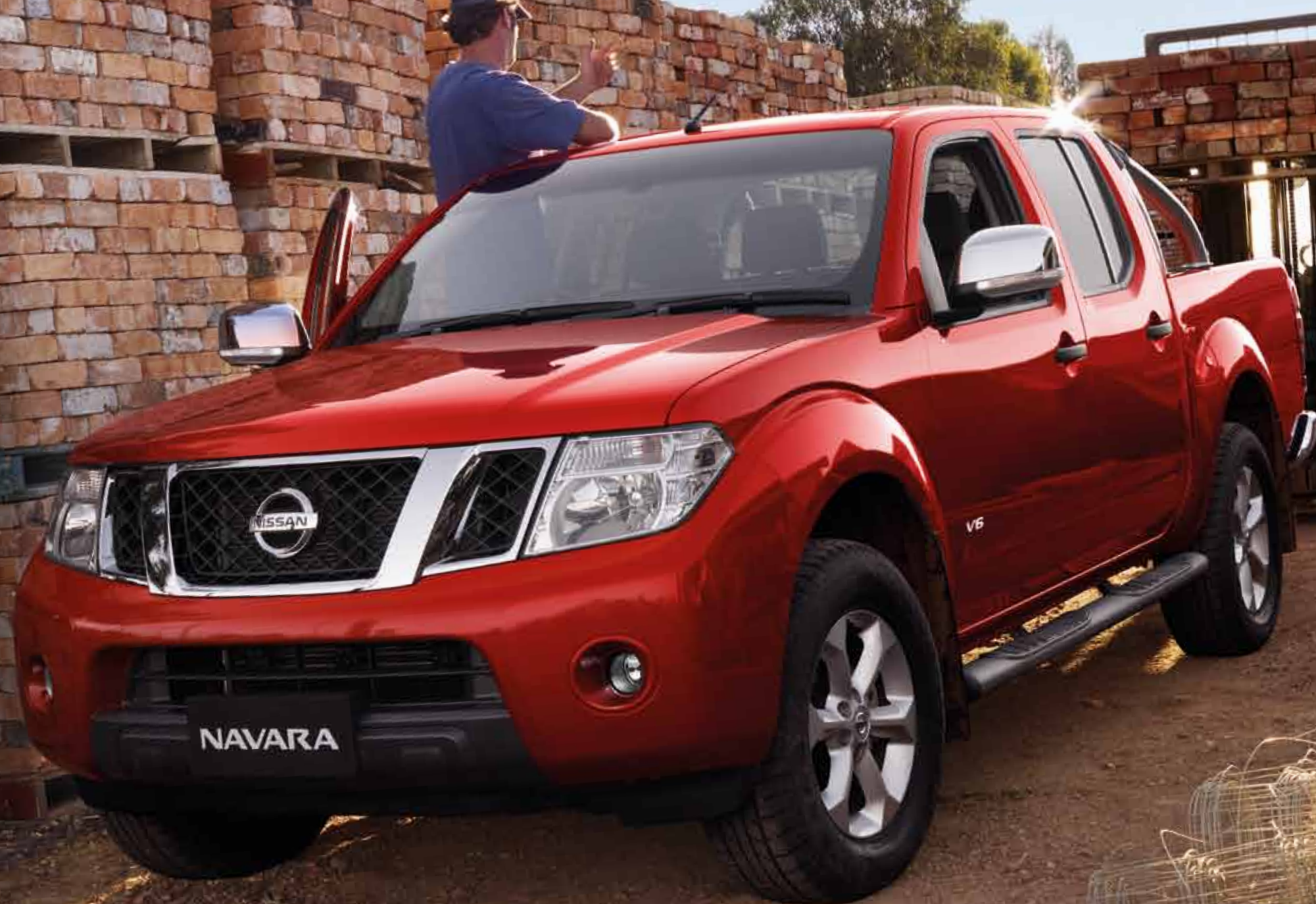
Flame Red ST-X Dual Cab 4x4

*iPod is a registered trade mark of Apple Inc.