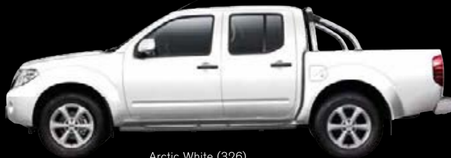
Arctic White (326)