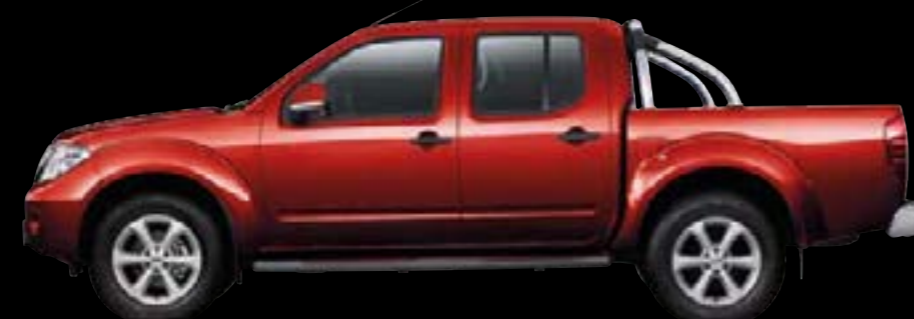
Flame Red (Z10)