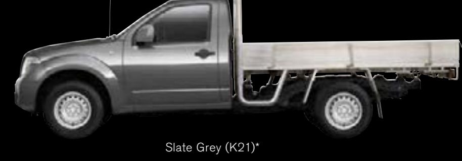
Slate Grey (K21)*