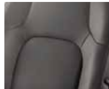
Interior leather seat trim (ST-X 550).