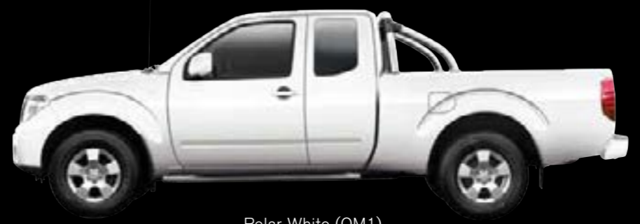
Polar White (QM1)