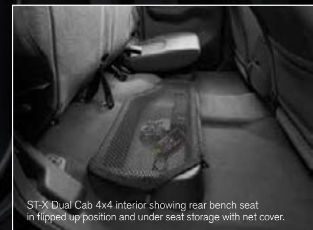
ST-X Dual Cab 4x4 interior showing rear bench seat in flipped up position and under seat storage with net cover.

The King Cab models include two fold-up seats in the spacious rear area for added flexibility.