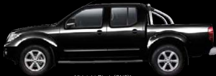
Midnight Black (GN0)*