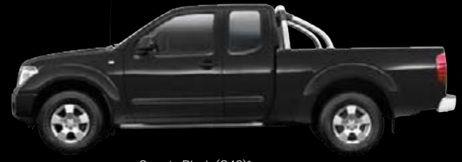
Cosmic Black (G42)*