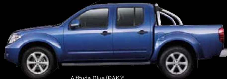
Altitude Blue (RAK)*