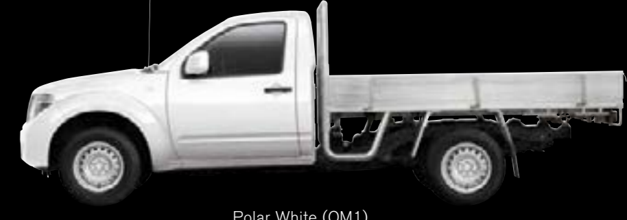
Polar White (QM1)