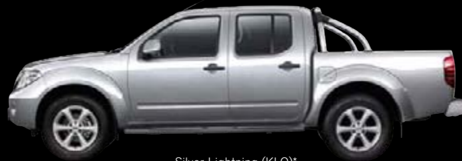
Silver Lightning (KLO)*