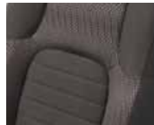
Interior cloth seat trim (ST and ST-X Dual Cab models).