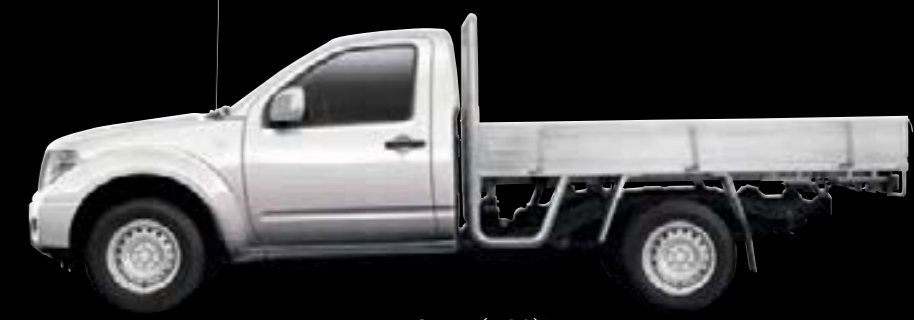
Brilliant Silver (K23)*