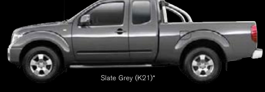
Slate Grey (K21)*