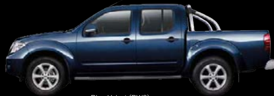
Blue Velvet (BW9)