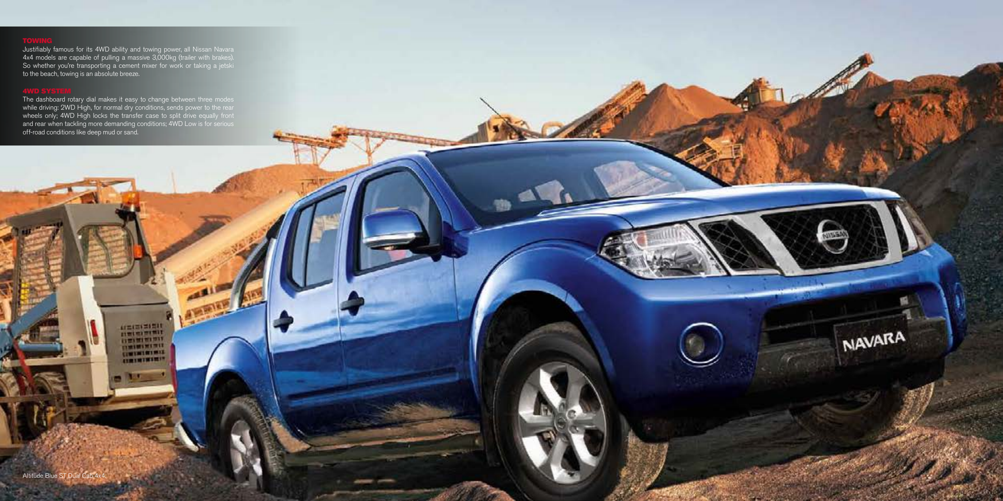
Altitude Blue ST Dual Cab 4x4.

The dashboard rotary dial makes it easy to change between three modes while driving: 2WD High, for normal dry conditions, sends power to the rear wheels only; 4WD High locks the transfer case to split drive equally front and rear when tackling more demanding conditions; 4WD Low is for serious off-road conditions like deep mud or sand.