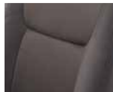
Interior cloth seat trim (RX Single Cab, RX Dual Cab and RX/ST-X King Cab).

All illustrations, information and specifications presented and referred to in this brochure were correct at the time this brochure was approved for printing. The colours in the photographs may vary from actual colours. However, Nissan Motor Co (Australia) Pty. Ltd. reserves the right, subject to the laws of Australia and/or the regulations of any competent authority which may apply from time to time, at its discretion at anytime and without prior notice to discontinue or change the models, features, specifications, designs and prices of the products referred to in this brochure and any optional equipment therefore without incurring any liability whatsoever to any purchaser or prospective purchaser of any such products. Some of the items referred to herein are optional at extra cost. Some options may be required in combination with other options. Always consult your Nissan Dealer for the latest information on models, specifications, features, prices, options and availability. Nissan Motor Co (Australia) Pty. Ltd. ACN 004 663 156. Printed July 2012. NAV0537