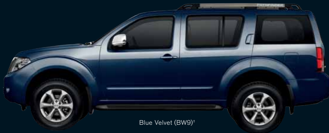
Blue Velvet (BW9)*