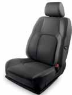
Leather seat trim ST-L, Ti and Ti 550.