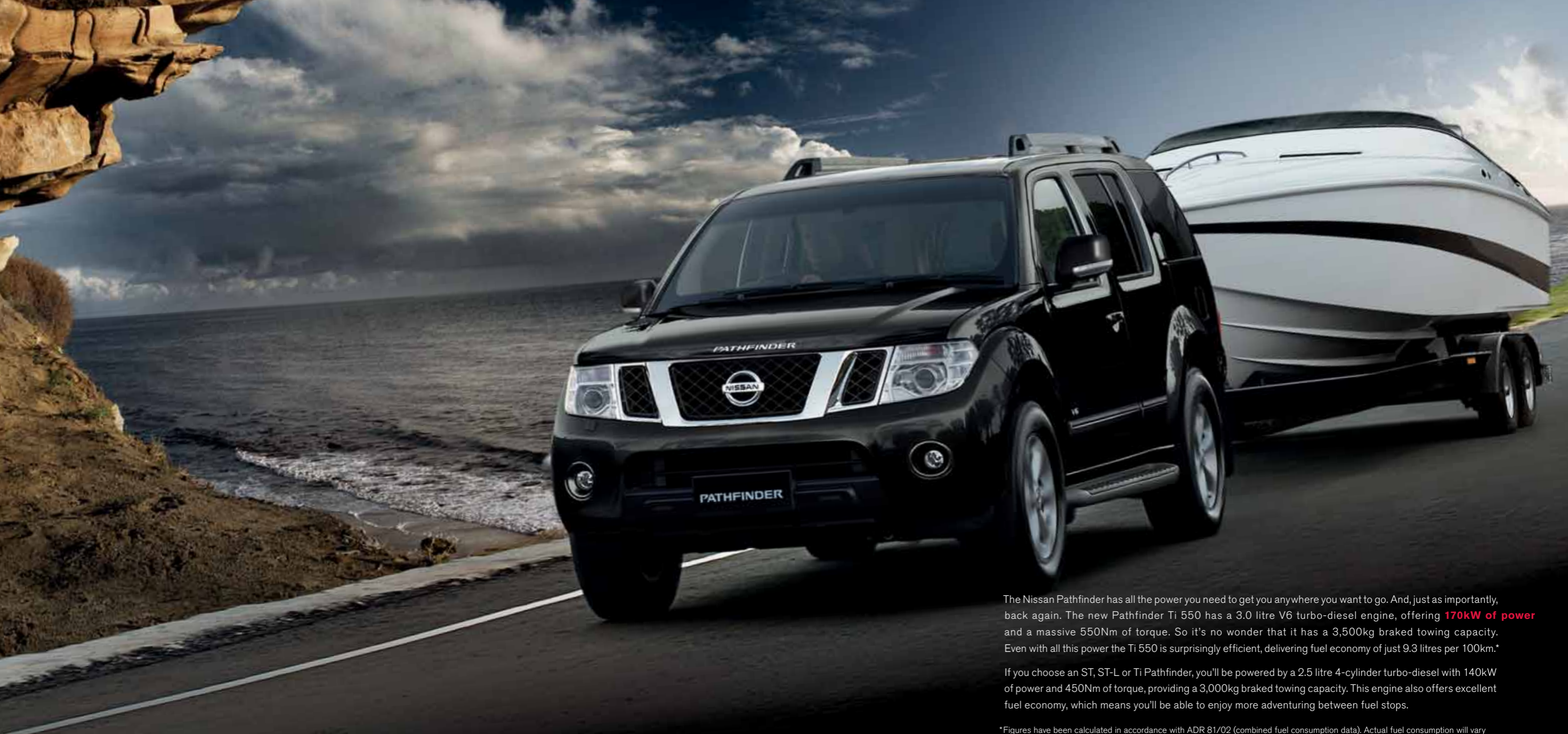
Midnight Black Ti 550.

The Nissan Pathfinder has all the power you need to get you anywhere you want to go. And, just as importantly, back again. The new Pathfinder Ti 550 has a 3.0 litre V6 turbo-diesel engine, offering 170kW of power and a massive 550Nm of torque. So it's no wonder that it has a 3,500kg braked towing capacity. Even with all this power the Ti 550 is surprisingly efficient, delivering fuel economy of just 9.3 litres per 100km.*