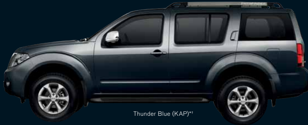
Thunder Blue (KAP)**