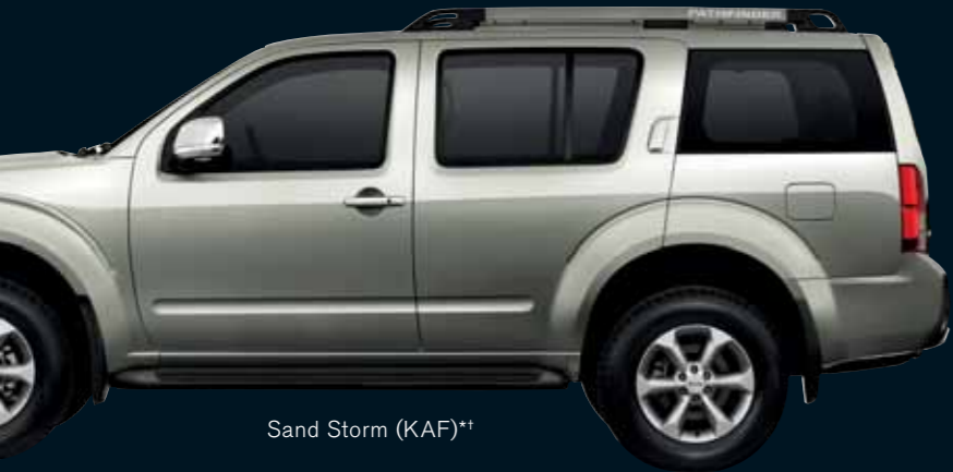
Sand Storm (KAF)**