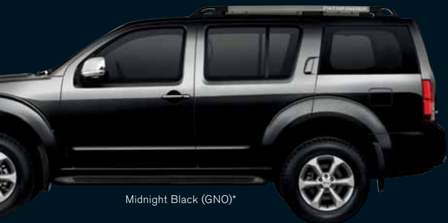
Midnight Black (GNO)*