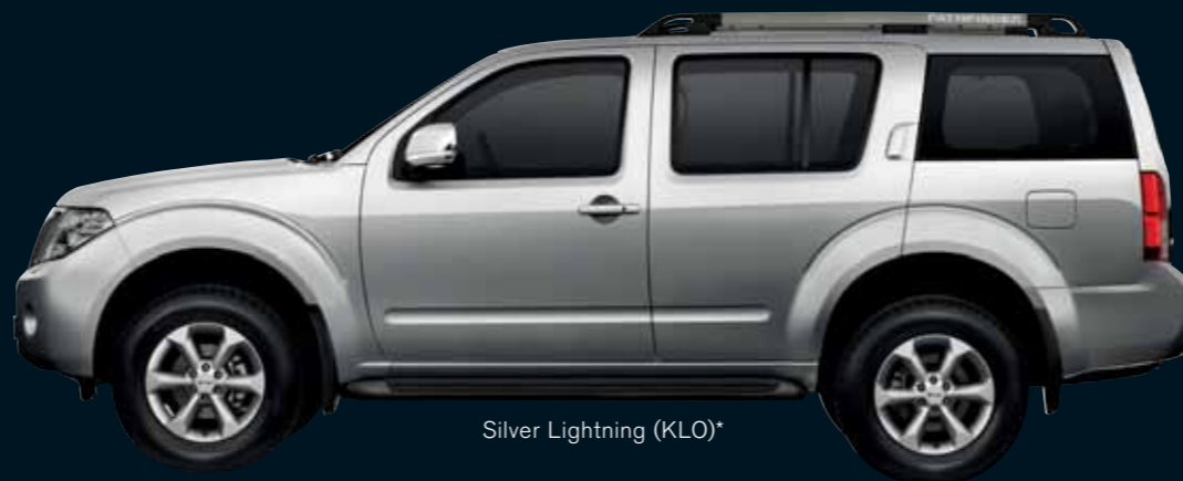
Silver Lightning (KLO)*