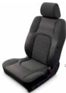
Luxury cloth seat trim ST.

All illustrations, information and specifications presented and referred to in this brochure were correct at the time this brochure was approved for printing. The colours in the photographs may vary from actual colours. However, Nissan Motor Co (Australia) Pty. Ltd. reserves the right, subject to the laws of Australia and/or the regulations of any competent authority which may apply from time to time, at its discretion at any time and without prior notice, to discontinue or change the models, features, specifications, designs and prices of the products referred to in this brochure and any optional equipment, therefore without incurring any liability whatsoever to any purchaser or prospective purchaser of any such products. Some of the items referred to herein are optional at extra cost. Some options may be required in combination with other options. Always consult your Nissan Dealer for the latest information on models, specifications, features, prices, options and availability. Nissan Motor Co (Australia) Pty. Ltd. ACN 004 663 156. Printed February 2011. PTHG314