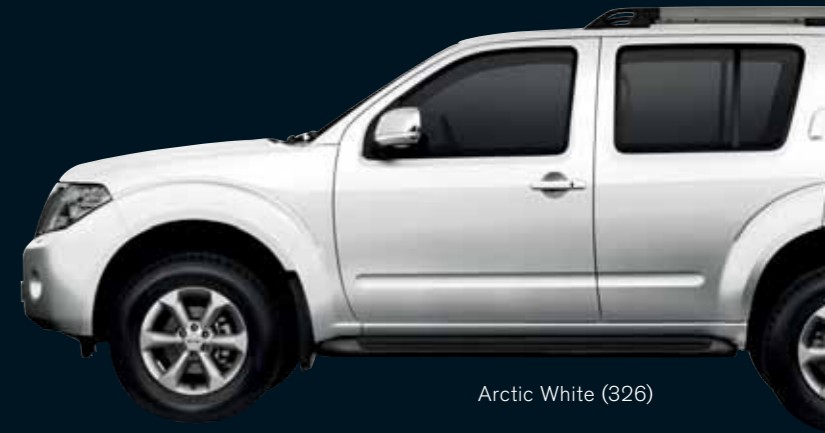
Arctic White (326)