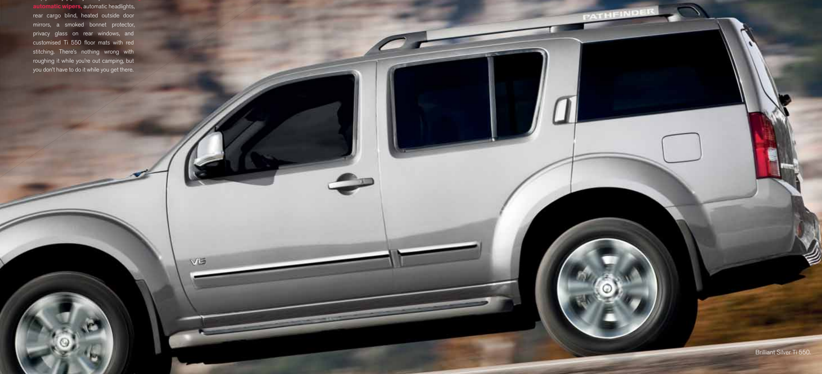
Brilliant Silver Ti 550.

The new Nissan Pathfinder Ti 550 comes with a huge list of standard features to help you enjoy your journey. Rain sensing automatic wipers , automatic headlights, rear cargo blind, heated outside door mirrors, a smoked bonnet protector, privacy glass on rear windows, and customised Ti 550 floor mats with red stitching. There's nothing wrong with roughing it while you're out camping, but you don't have to do it while you get there.