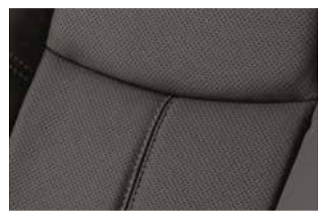
Black leather accented* seat trim. Available on ST-L and Ti only.