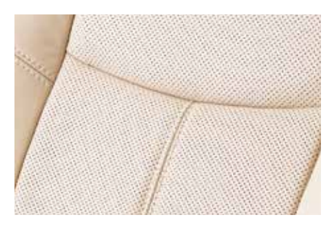
Ivory leather accented* seat trim. Available on ST-L and Ti

Minor trim variations may occur from time to time. +Leather accented features and upholstery may contain synthetic material.