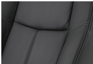
Leather accented* black seat trim. Available on ST-L and Ti only.

Minor trim variations may occur from time to time.