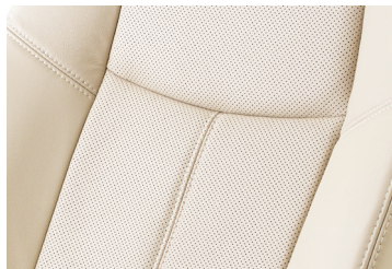
Leather accented* ivory seat trim. Available on ST-L and Ti in Galaxy Blue, Black Obsidian and Alpine White only.