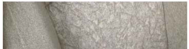
Moquette seat trim – ST Coil and DX Leaf.

my nissan our comprehensive ownership experience