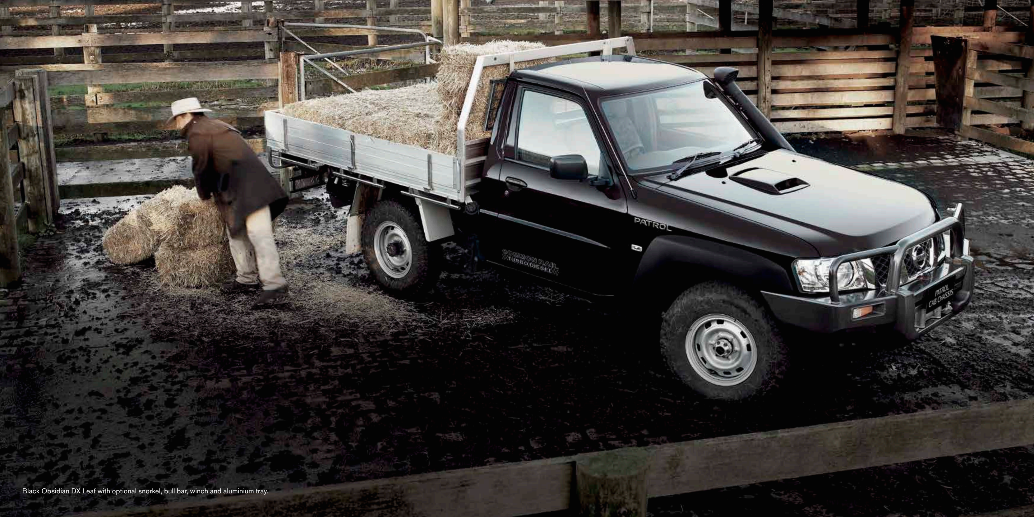
Black Obsidian DX Leaf with optional snorkel, bull bar, winch and aluminium tray.