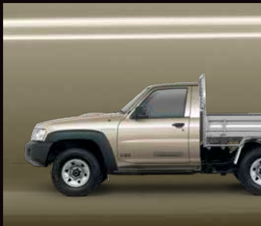
Desert Gold (EY0)**