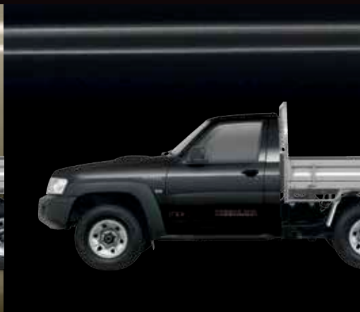
Black Obsidian (KH3)†