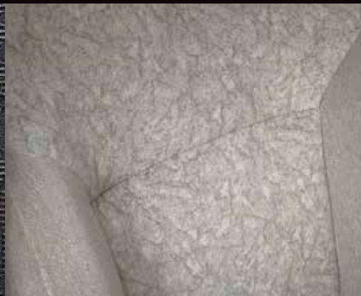
Moquette seat trim – ST