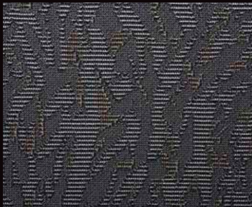
Woven seat trim – DX