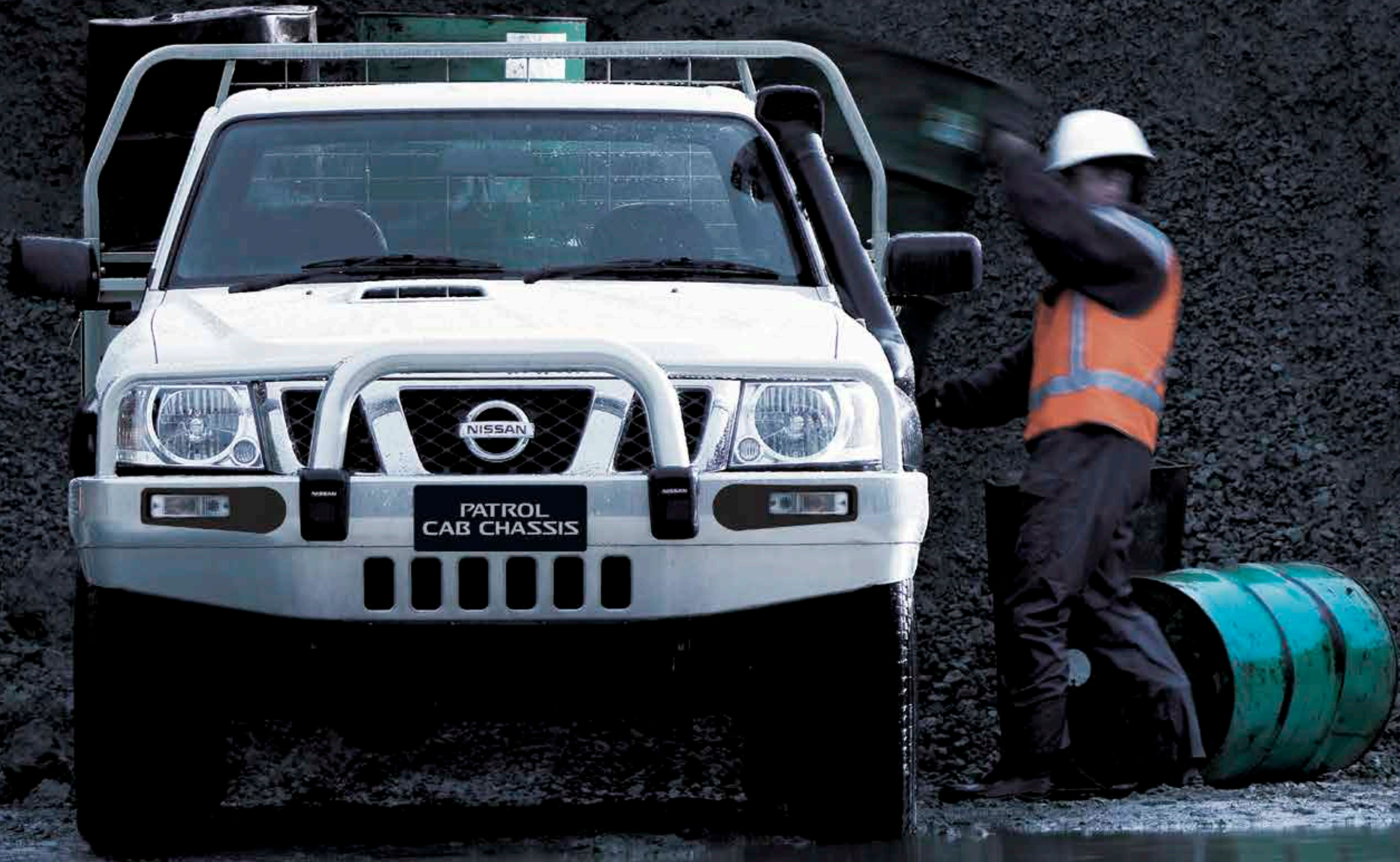
Polar White ST Coil with optional bull bar, snorkel and aluminium tray.