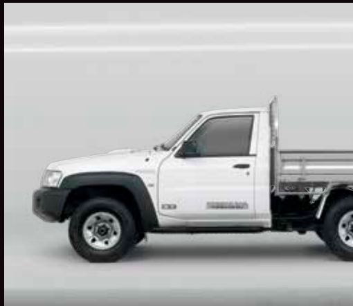
Polar White (QM1)*