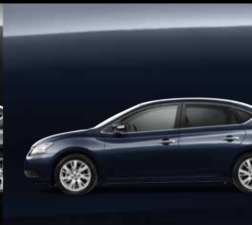
Deep Sapphire (RAA)*