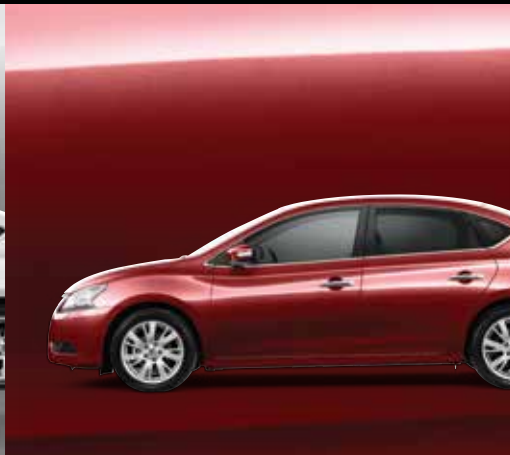
Cayenne Red (NAH)*