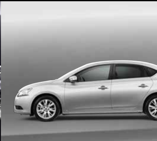
Brilliant Silver (K23)*