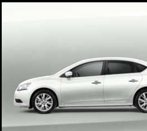
White Diamond (QX1)