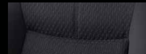
Interior black cloth ST-L seat trim.