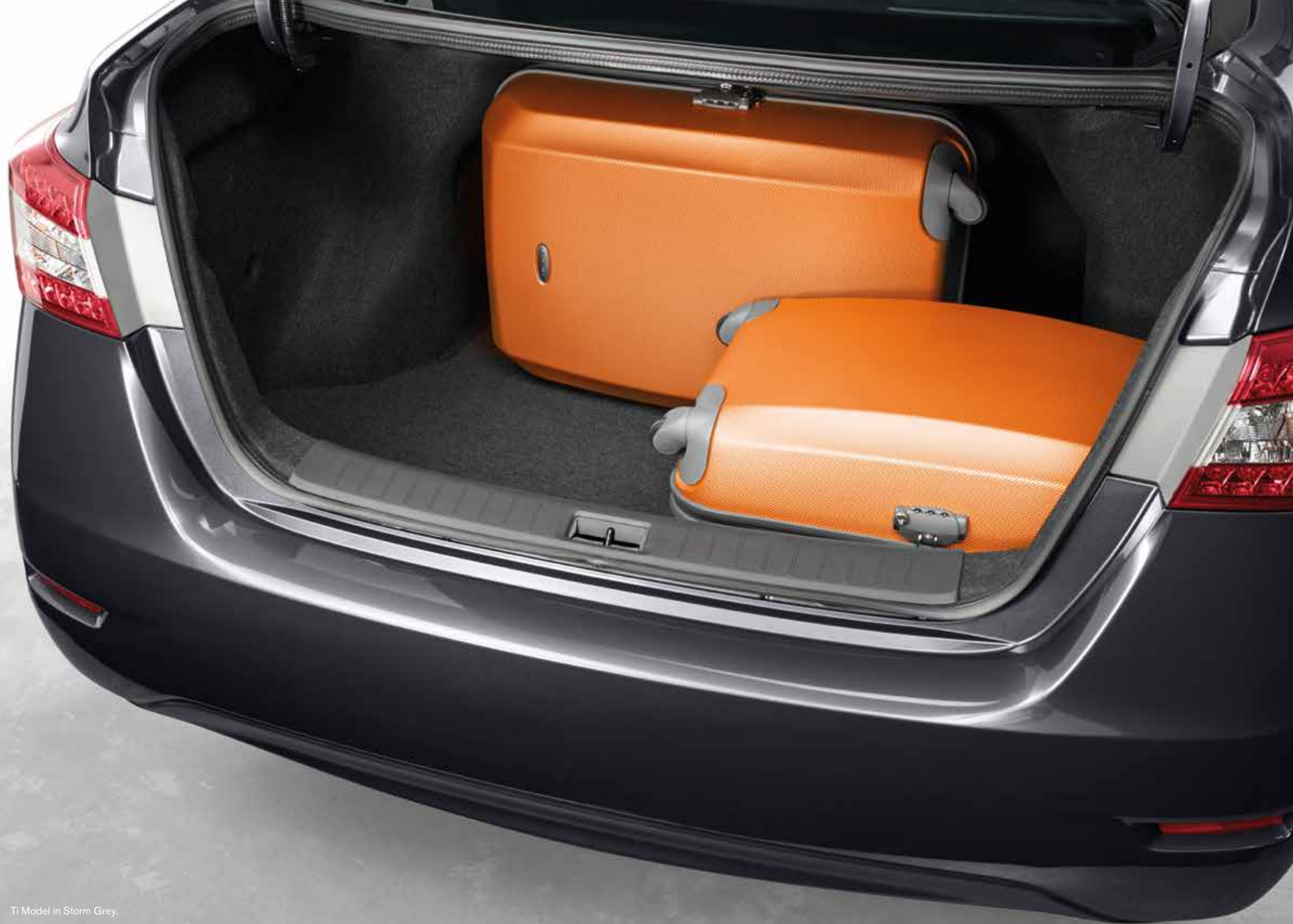
Ti Model in Storm Grey.