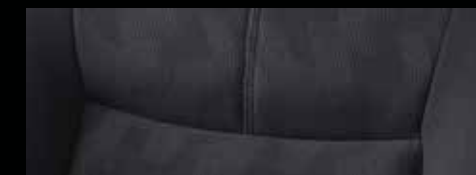
Interior black cloth ST seat trim.