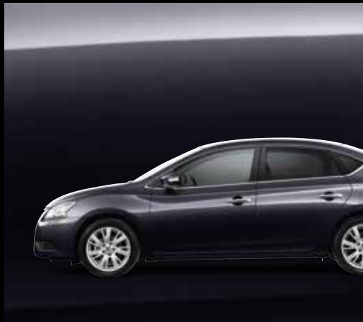
Storm Grey (KBD)*