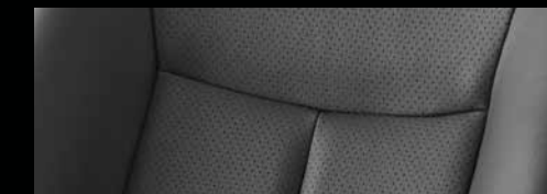
Interior black leather accented^ SSS seat trim.

For more information please visit nissan.com.au/owners , ask your Nissan Dealer or phone 1800 035 035 during normal business hours.