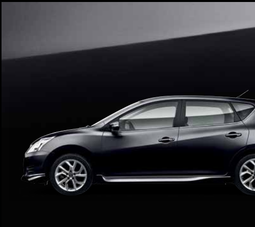
Storm Grey (KBD)*