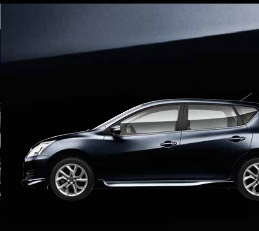
Deep Sapphire (RAA)*