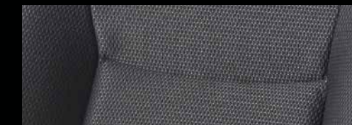
Interior black cloth ST seat trim.

* iPod is a trademark of Apple inc. ^Leather accented features and upholstery may contain synthetic material