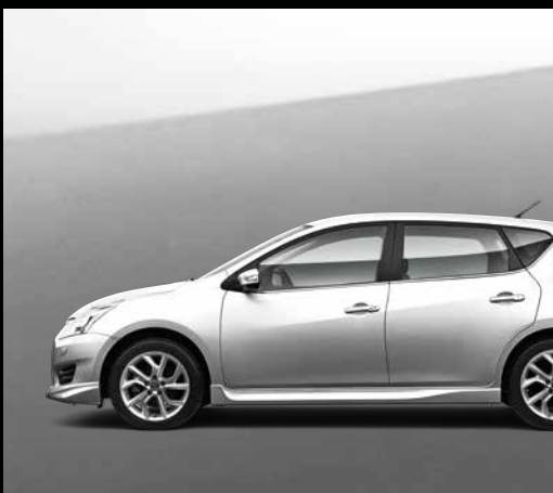
Polar White (QM1)