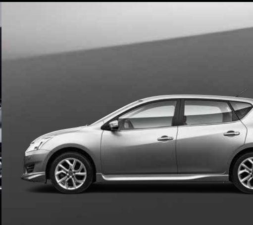
Brilliant Silver (K23)*