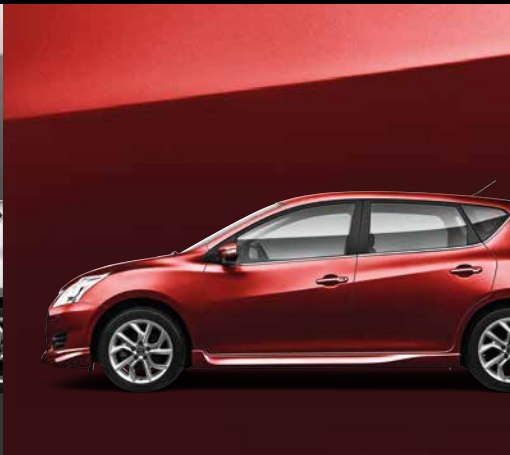
Cayenne Red (NAH)*