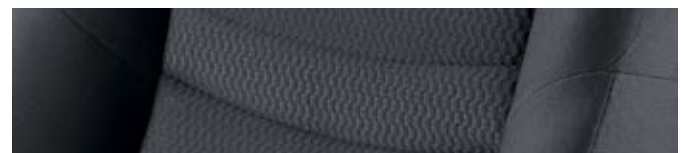
Cloth Seat Trim. Available on ST model only.