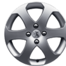
16" alloy wheel (Touring)