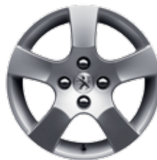
16" alloy wheel (XT)