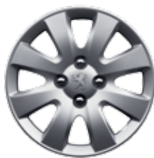
15" steel wheel (XR)