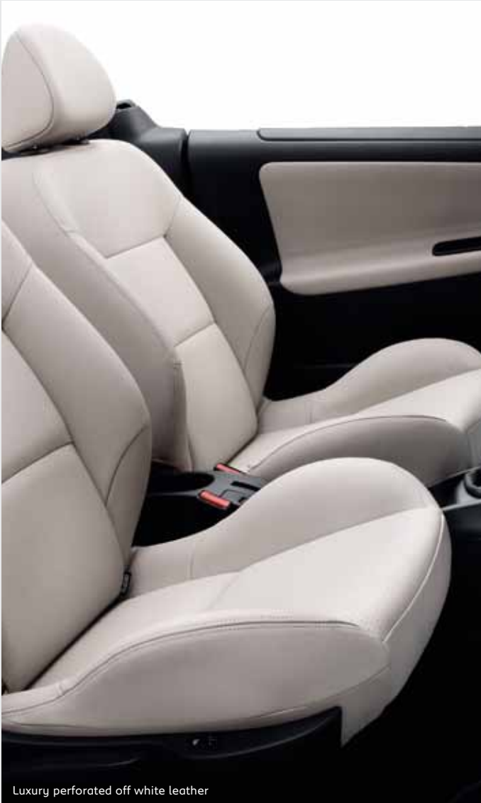
Luxury perforated off white leather