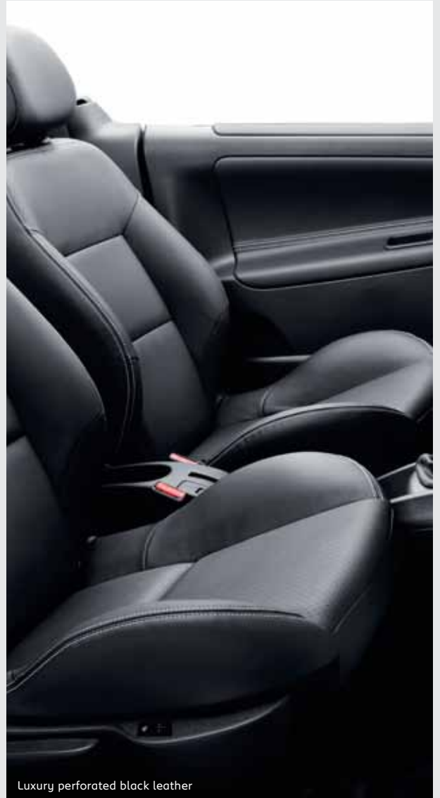
Luxury perforated black leather