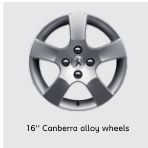
16" Canberra alloy wheels