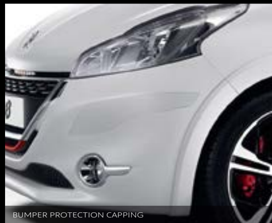
BUMPER PROTECTION CAPPING