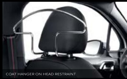
COAT HANGER ON HEAD RESTRAINT

For even more comfort and practicality, it's easy to equip your 208 GTi with accessories suited to your lifestyle.