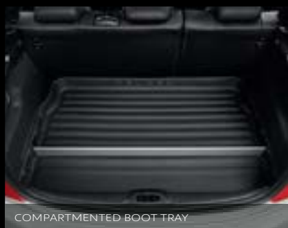
COMPARTMENTED BOOT TRAY