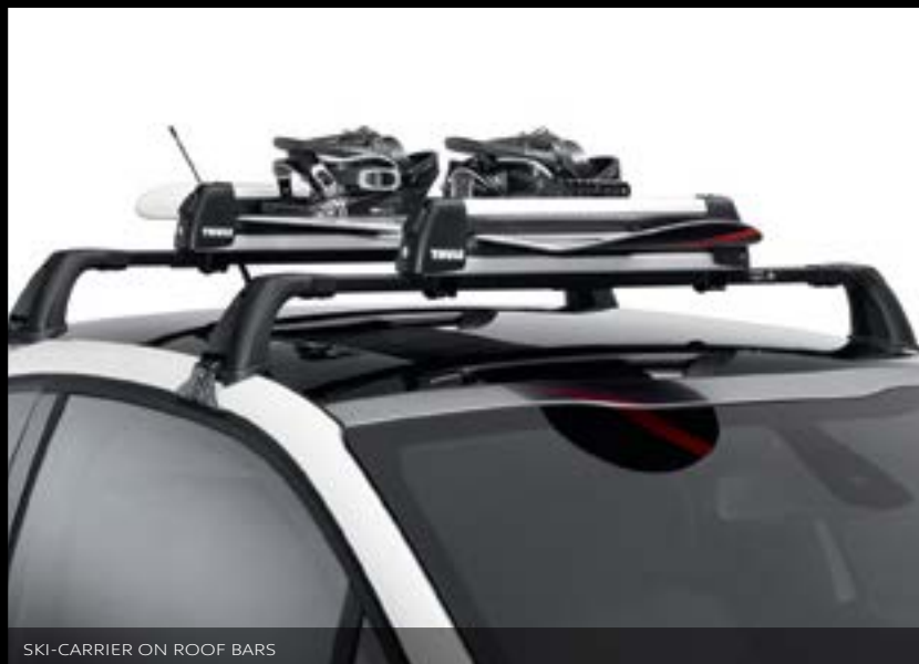
SKI-CARRIER ON ROOF BARS

For even more comfort and practicality, it's easy to equip your 208 GTi with accessories suited to your lifestyle.