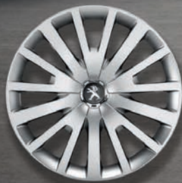
15" Ambre trims Access