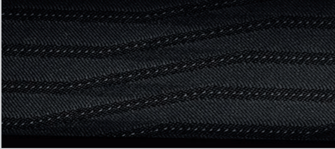
Black Metax Mistral warp and weft. Access model.