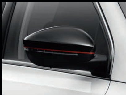
Side view mirror