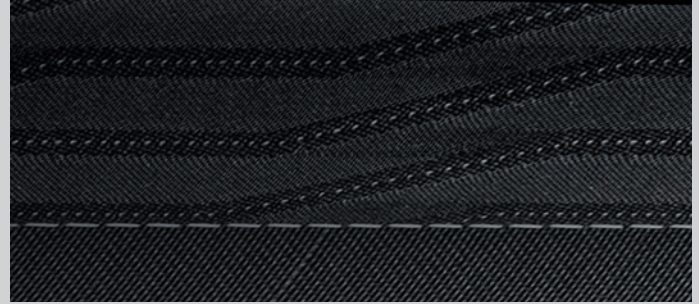
Black Metax Mistral warp and weft with concrete over stitch detail. Active model.