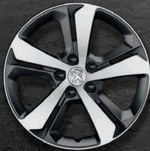
17" Diamond Rubis alloy wheels Allure BlueHDi and 110 kW eTHP (available in 2015)