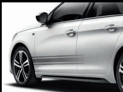
Ligne S decal options