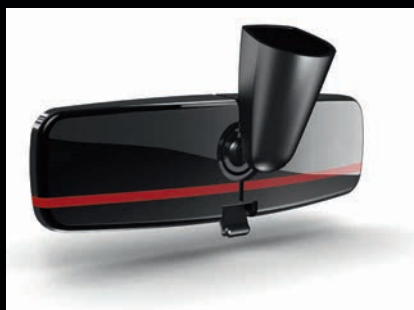
Rear view mirror cover