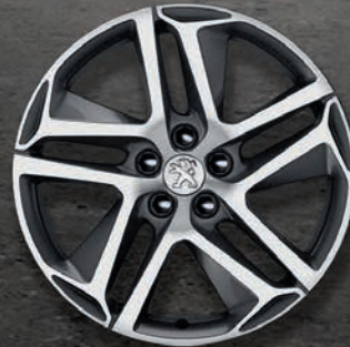
18" Diamond Saphir alloy wheels Allure Premium