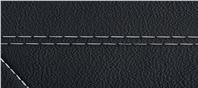
Mistral black Nappa Club leather.*

A striking selection of trim levels are available across all models of the all-new Peugeot 308 Hatch and Touring.