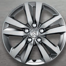
16" Quartz alloy wheels Active