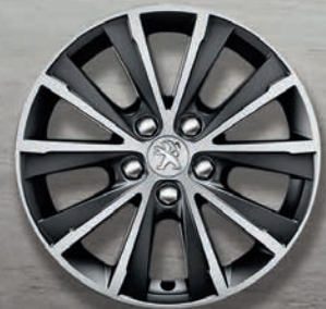
16" Diamond Topaze alloy wheels Allure 96 kW