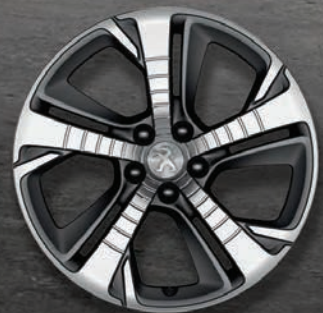
GT alloy wheels (available in 2015)