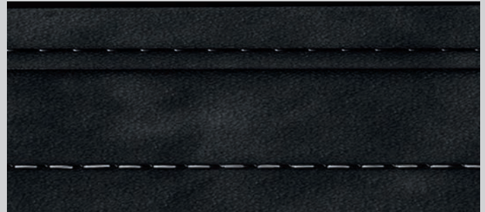
Black Mistral half-PVC/Alcantara. Allure Premium and GT models (available in 2015).