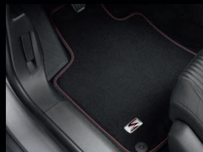
Ligne S carpet mats