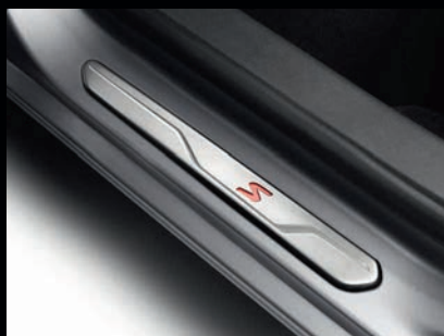
Backlit sill protectors