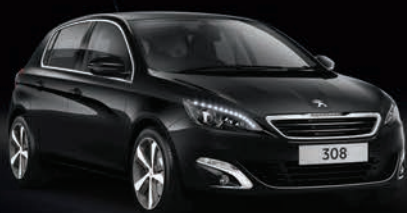
Pearla Nera Black*