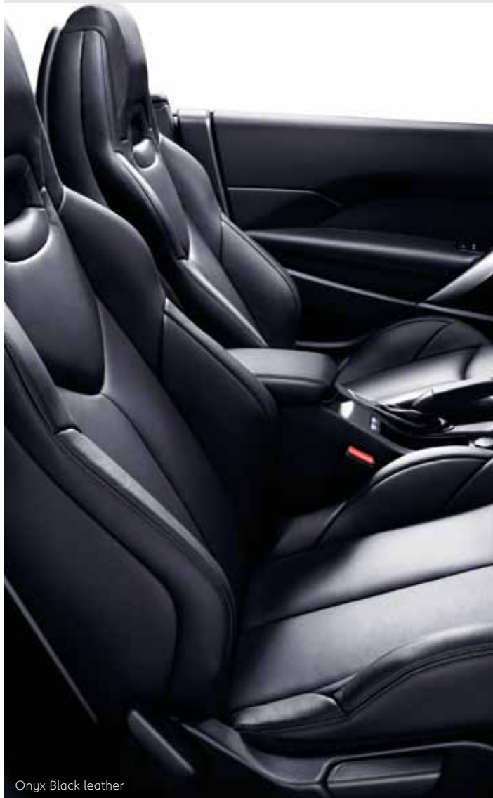
Onyx Black leather