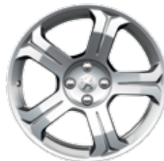
18" Lincancabur Alloy Wheels (optional)