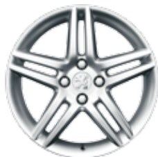
17" Stromboli Alloy Wheels