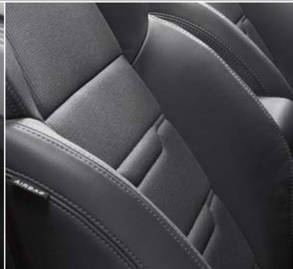
Marston partial-leather trim

A sumptuous leather and cloth combination which perfectly captures the sporting spirit of the 508 GT.