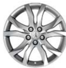
Allure 17** alloy wheel