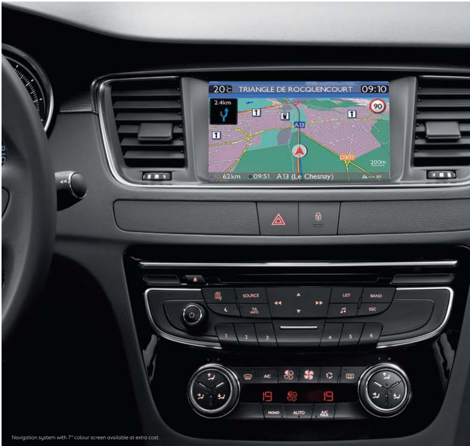
Navigation system with 7" colour screen available at extra cost.