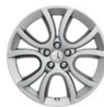
Allure 18** alloy wheel