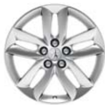
Active 17** alloy wheel