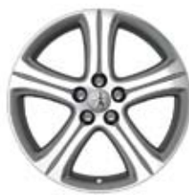
GT 18** alloy wheel