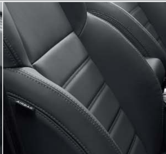
Tramontane Nappa leather trim

Nappa leather* seat trim expresses elegance and quality, reinforcing the top-of-the-range character of the 508 GT.