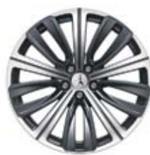
GT 19** alloy wheel