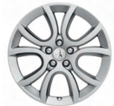
Allure 18" alloy wheel