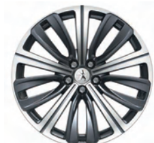
GT 19" alloy wheel