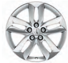
Active 17" alloy wheel

A wide range of alloy wheels are available on the 508.