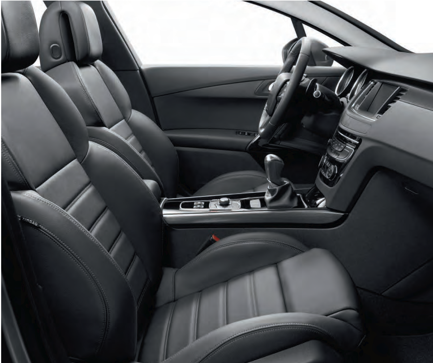
Claudia leather trim

Leather accented seats contribute to the refinement of the passenger compartment.