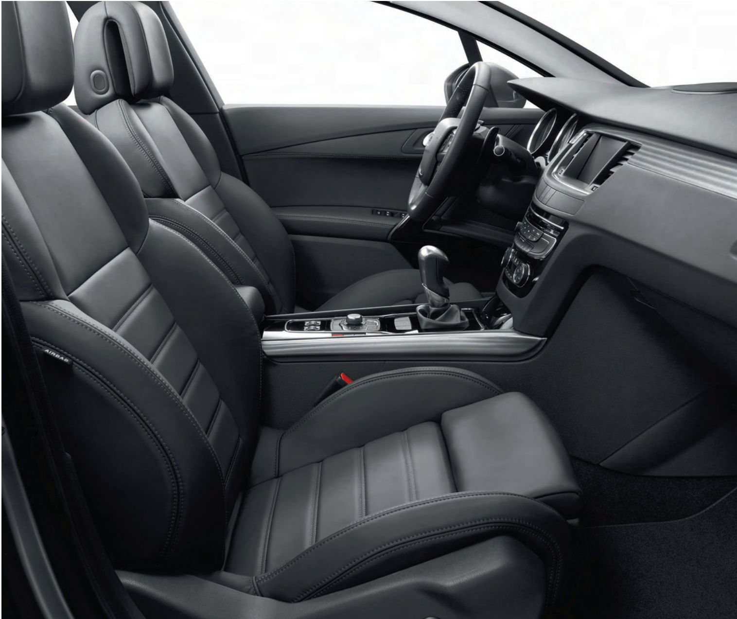
Nappa leather trim

Nappa leather accented seat trim expresses elegance and quality, reinforcing the top-of-the-range character of the GT.