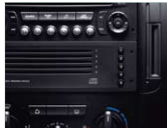
In-dash CD stacker