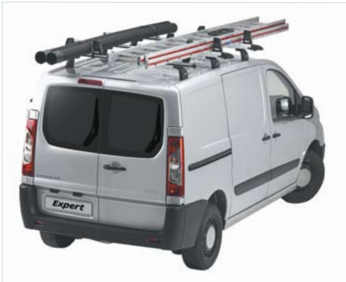
Roof Bars and a wide range of roof mounted accessories let you carry additional loads with complete safety.

Peugeot Accessories are designed specifically for each model, which means there are no compromises on fit or function. In addition, they are tested to our own high standards giving you complete confidence and piece of mind. Peugeot Accessories help equip your Expert van with all the comforts you'd expect of a mobile office. Your Peugeot Dealer can also assist you in selecting the fitout best suited to your business.