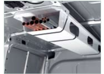
Long load tunnel