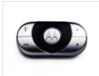
Mobile phone Bluetooth kit