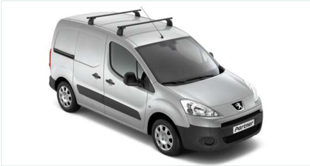
Roof bars and a wide range of roof mounted accessories let you carry additional loads with complete safety.

Peugeot Accessories are designed specifically for each model, which means there are no compromises on fit or function. In addition, they are tested to our own high standards giving you complete confidence and piece of mind. Peugeot Accessories help equip your Partner van with all the comforts you'd expect of a mobile office. Your Peugeot Dealer can also assist you in selecting the fitout best suited to your business.