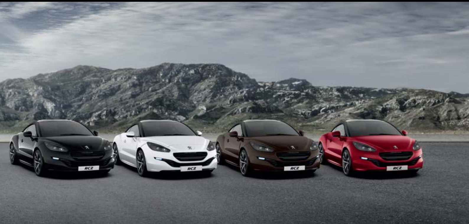
Perla nera black