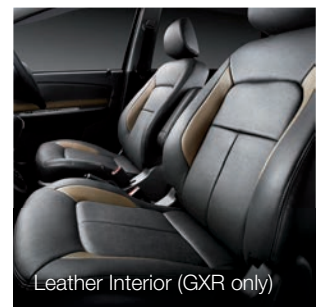
Leather Interior (GXR only)