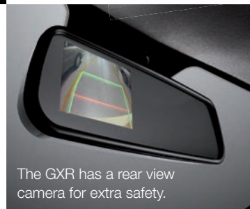
The GXR has a rear view camera for extra safety.