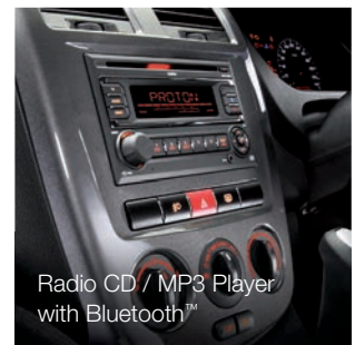
Radio CD / MP3 Player with Bluetooth™