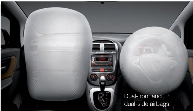
Dual-front and dual-side airbags.