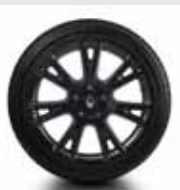
BLACK SPEEDLINE CUP WHEEL

It should be noted that printing limitations do not permit the subtle paintwork shades on these pages to be shown with absolute accuracy. Only personal inspection of the Clio Renault Sport Australian Grand Prix Limited Edition at your Renault Dealer will reveal it in its true colours.