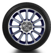
17" BEBOP ALLOY WHEELS WITH BLUE INSERTS

It should be noted that printing limitations do not permit the subtle paintwork shades on these pages to be shown with absolute accuracy. Only personal inspection of the Clio Gordini R.S. at your Renault Dealer will reveal it in its true colours.