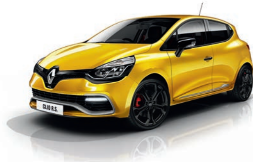
LIQUID YELLOW (J37) R