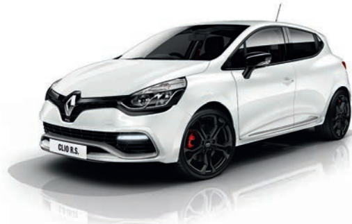
GLACIER WHITE (369) S