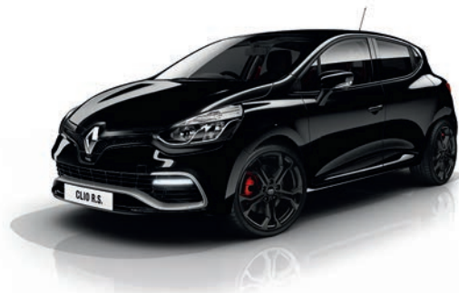
DEEP BLACK (GNA) M