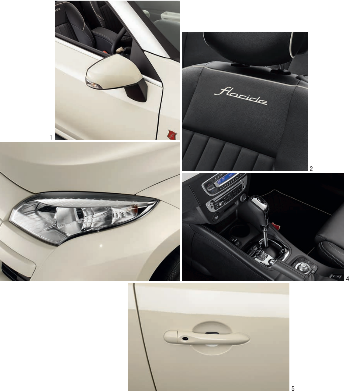
1. Turn indicator lights on door mirrors 2. Embossed charcoal leather front seats 3. Unique headlamp design 4. Floride limited edition branding in cabin 5. Exclusive Floride Ivory limited edition colour