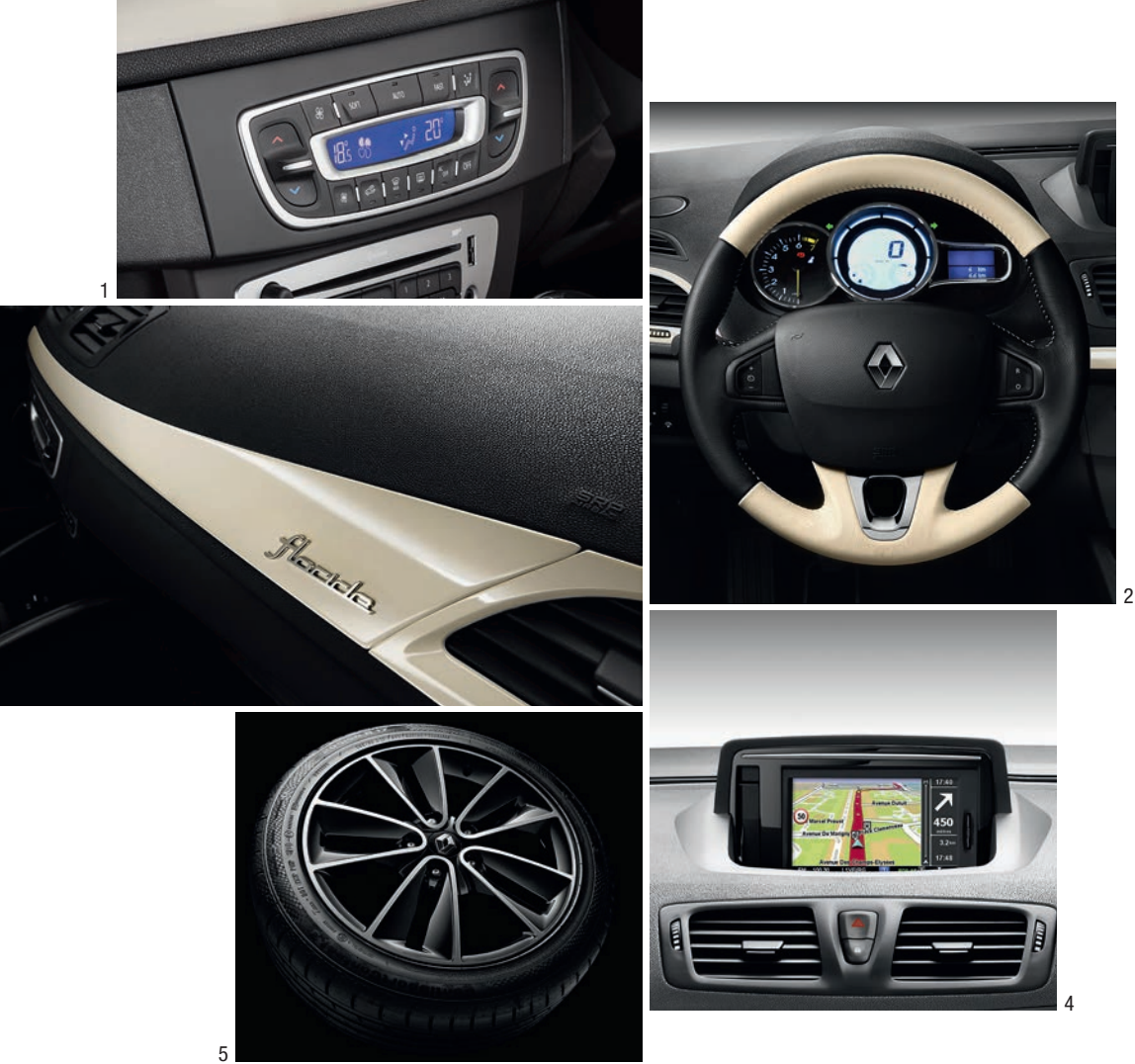
1. Dual-zone climate control 2. Digital speedometer 3. Interior dash 4. Integrated satellite navigation 5. 17" Black Sari alloy wheels