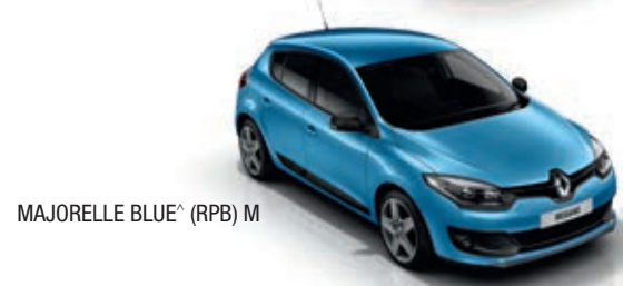
MAJORELLE BLUE* (RPB) M