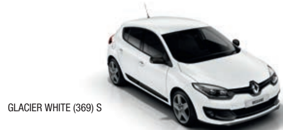
GLACIER WHITE (369) S