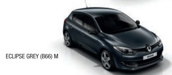
ECLIPSE GREY (B66) M