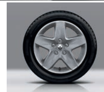
16" DESIGN SURROUND FLEX WHEELS