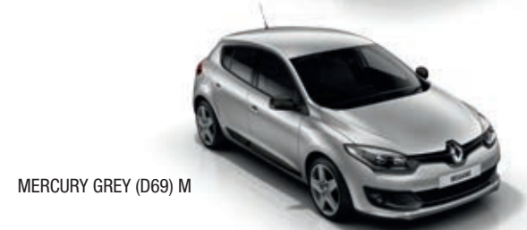
MERCURY GREY (D69) M