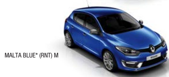
MALTA BLUE* (RNT) M