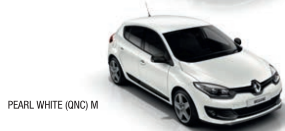
PEARL WHITE (QNC) M