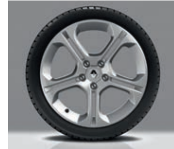
18" SERDARD ALLOY WHEELS