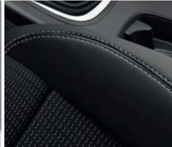
DARK CHARCOAL CLOTH LEATHERETTE TRIMMED UPHOLSTERY