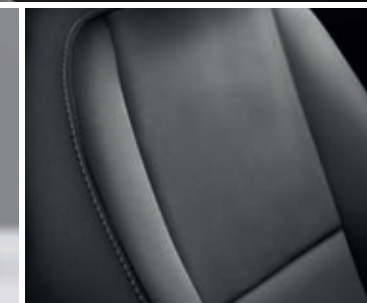
DARK CHARCOAL CLOTH UPHOLSTERY