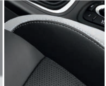
COOL GREY LEATHER UPHOLSTERY