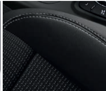
DARK CHARCOAL CLOTH LEATHERETTE TRIMMED UPHOLSTERY