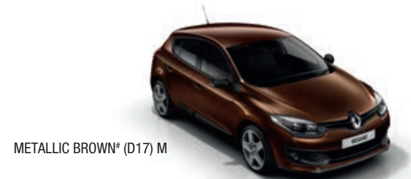
METALLIC BROWN* (D17) M