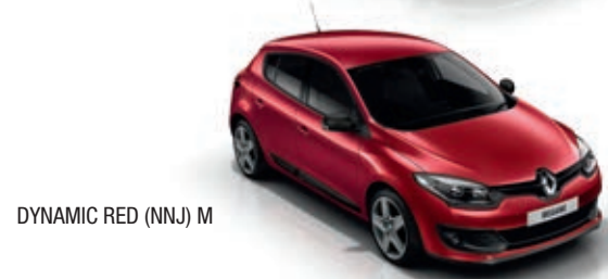
DYNAMIC RED (NNJ) M