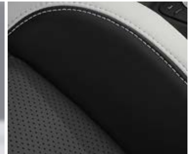
COOL GREY LEATHER UPHOLSTERY