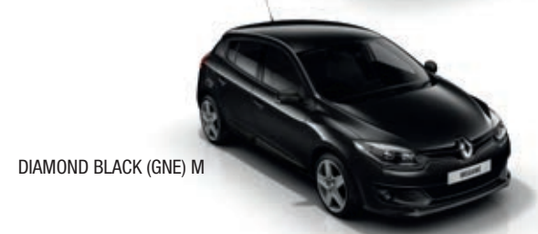
DIAMOND BLACK (GNE) M