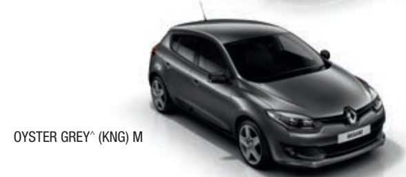
OYSTER GREY* (KNG) M